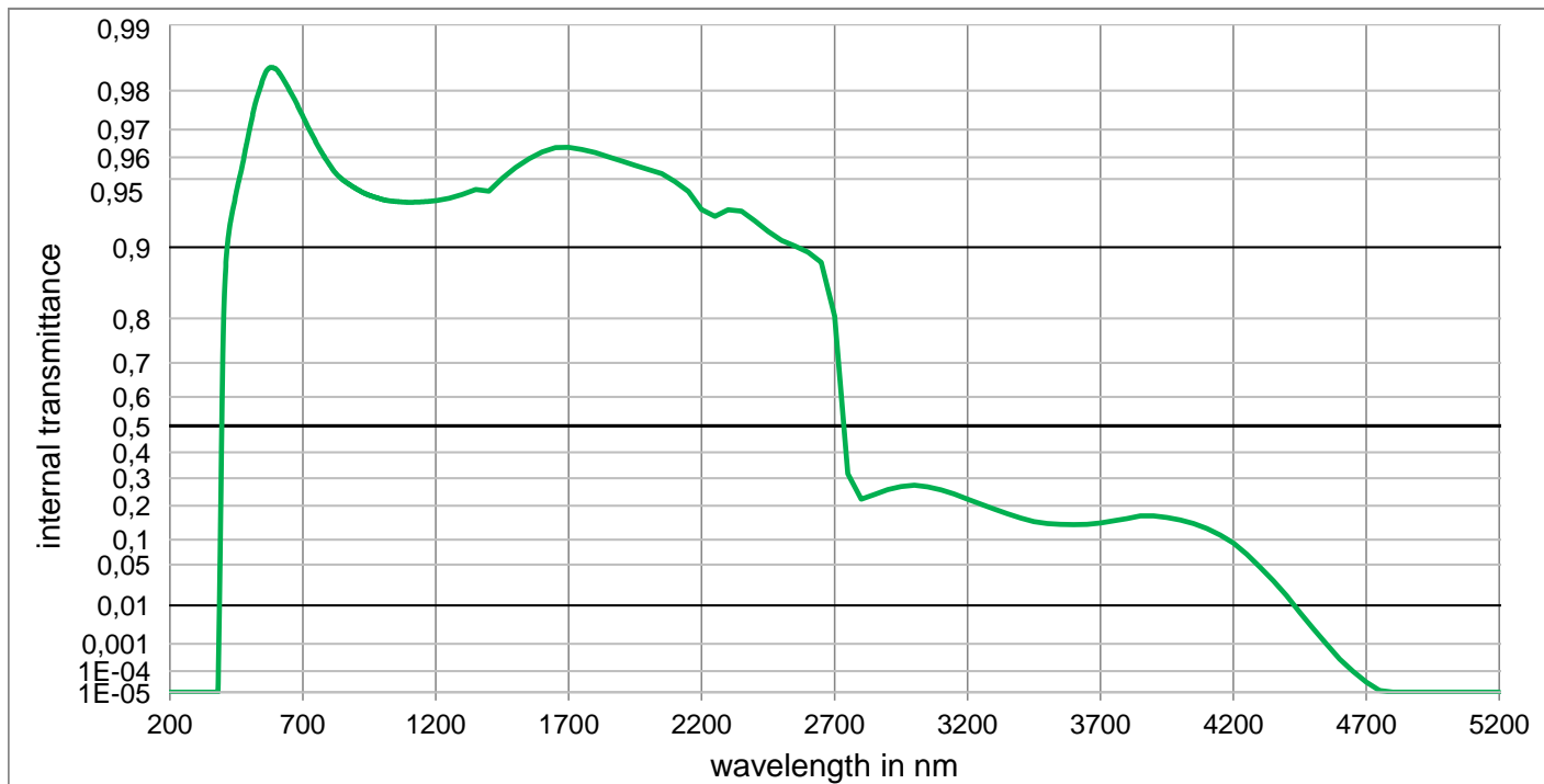
Internal transmittance \tau_i at reference thickness The internal transmittance values, tabulated and graphically represented, are reference values only