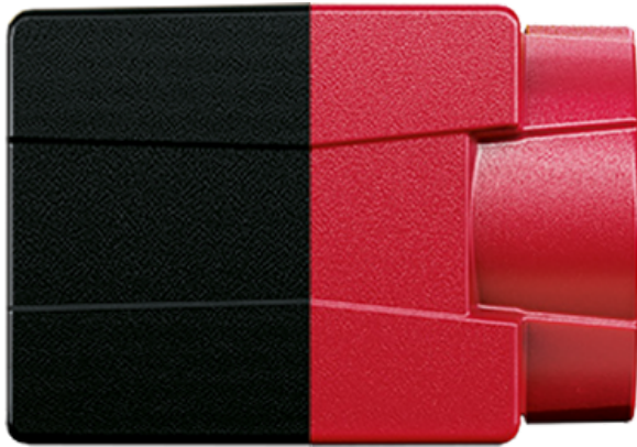
Hardware option: Closed Housing C-Mount