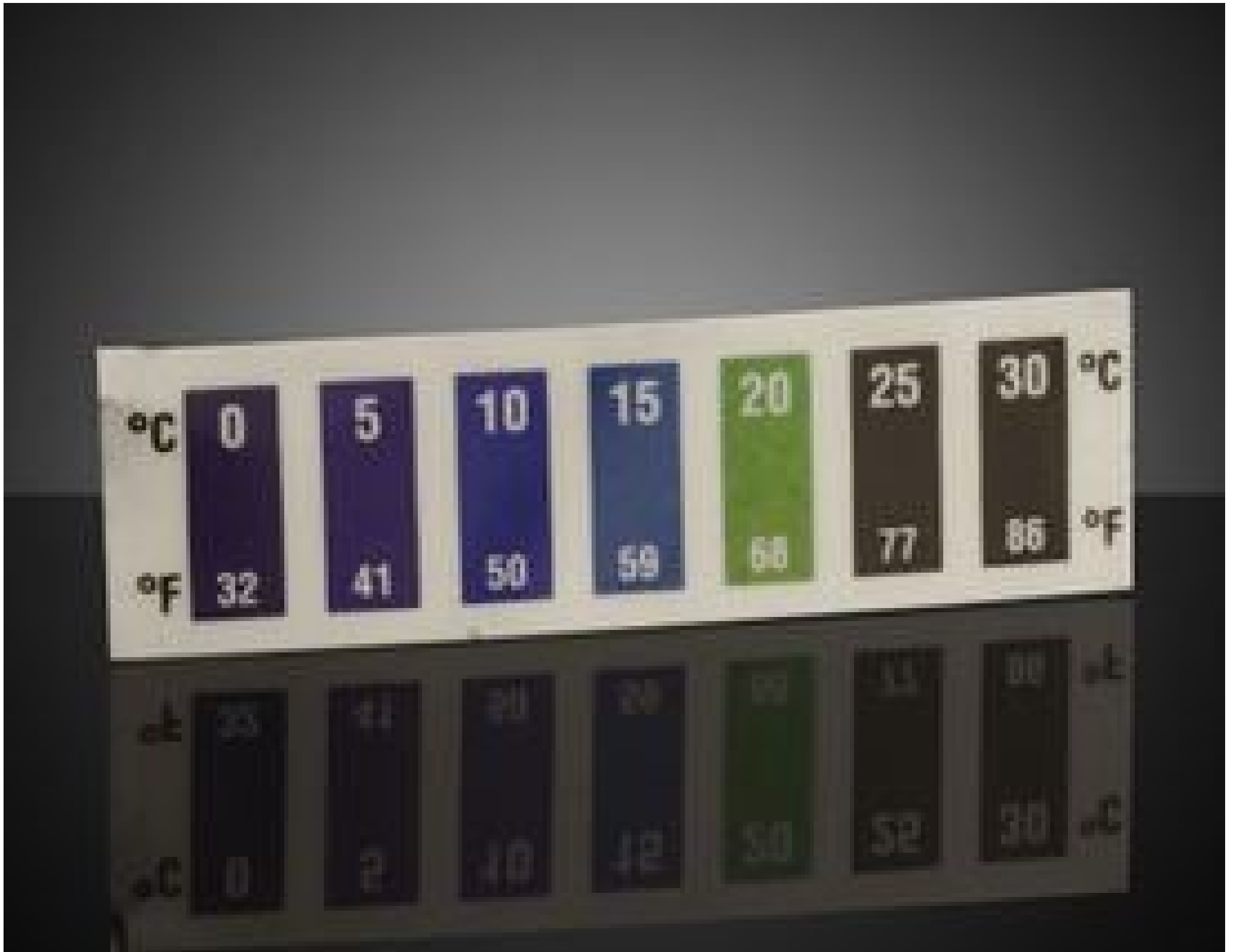
0 - 30°C Temp Range, Liquid Crystal Thermometers (10/Pack)