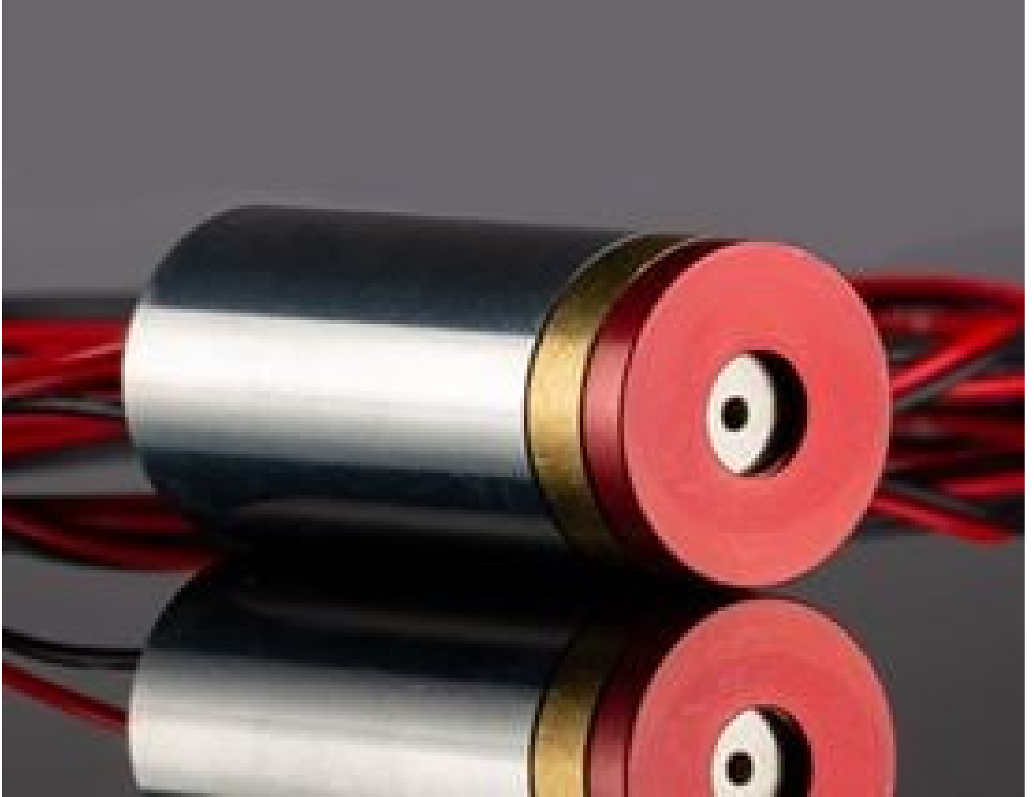
Coherent® VHK™ Circular Beam Visible Laser Diode