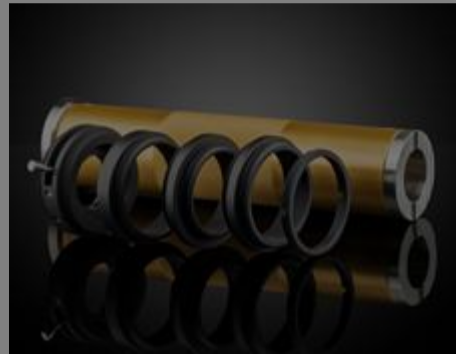
Multi-Element Tube System Accessories