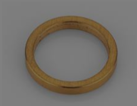
#03-631 - 0.5mm Thick, C-Mount Brass Spacer Ring €11,25