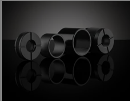
Multi-Element Tube System