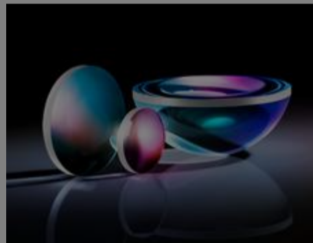
#32-956 - 6.0mm Dia. x 24.0mm FL, Uncoated, Plano-Convex Lens €29,50