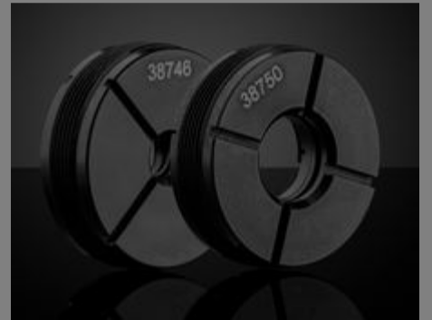
Multi-Element Inner Single Optic Mounts