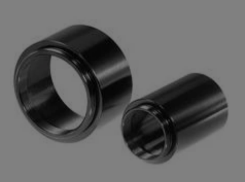
#53-838 - 111.5mm Length, C-Mount Extension Tube €96,50