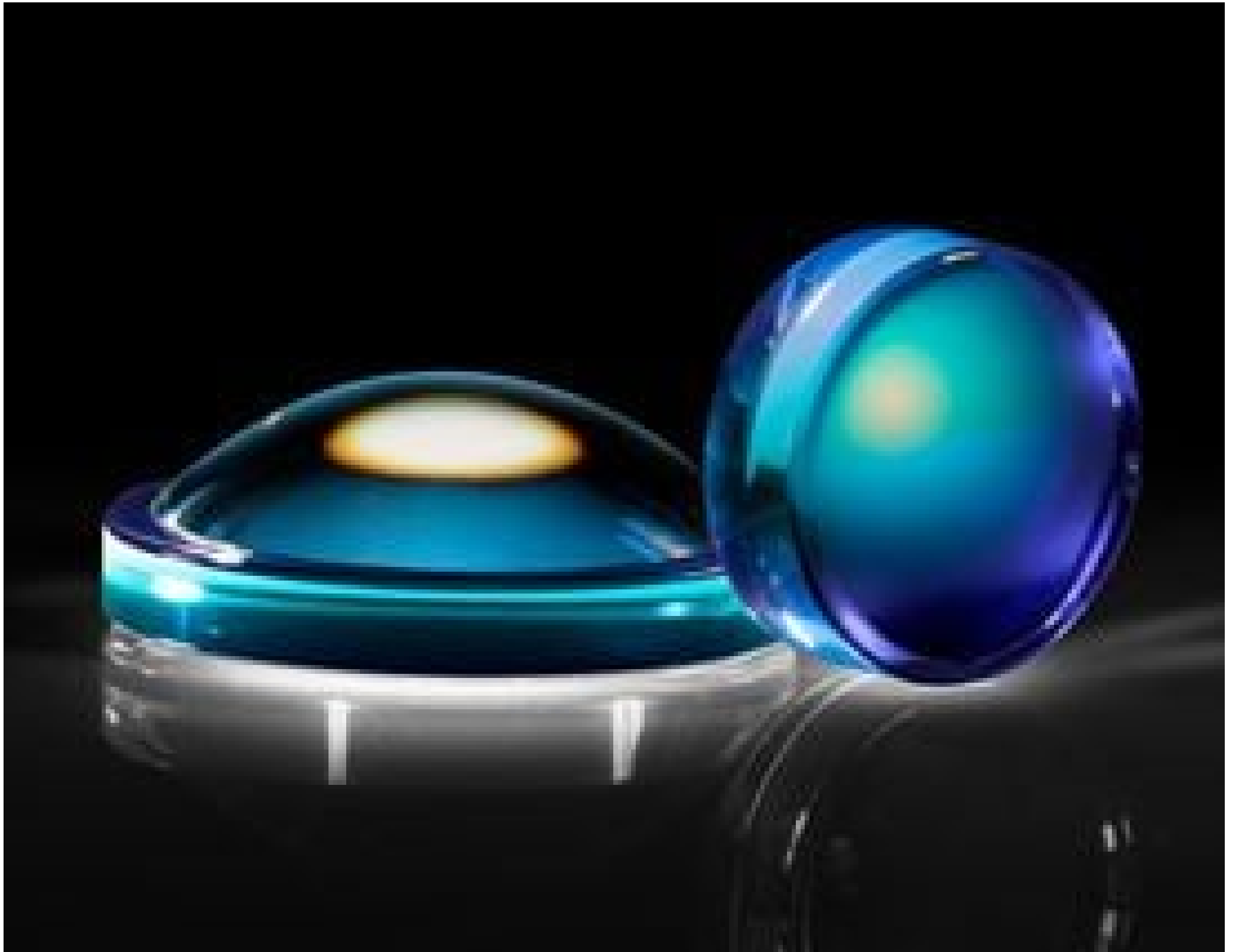
Precision Molded Aspheric Lenses