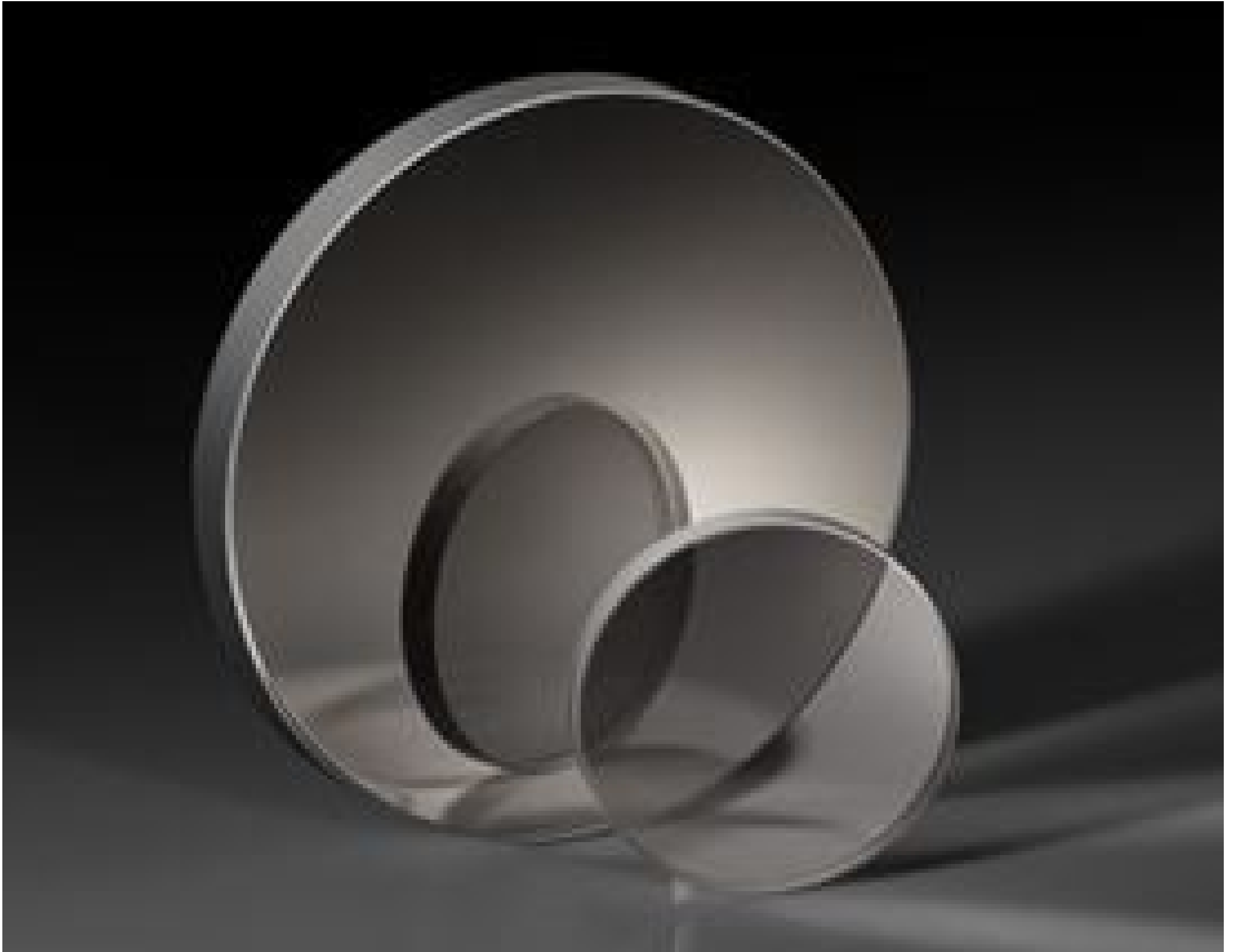
Near-IR (NIR) Neutral Density (ND) Filters