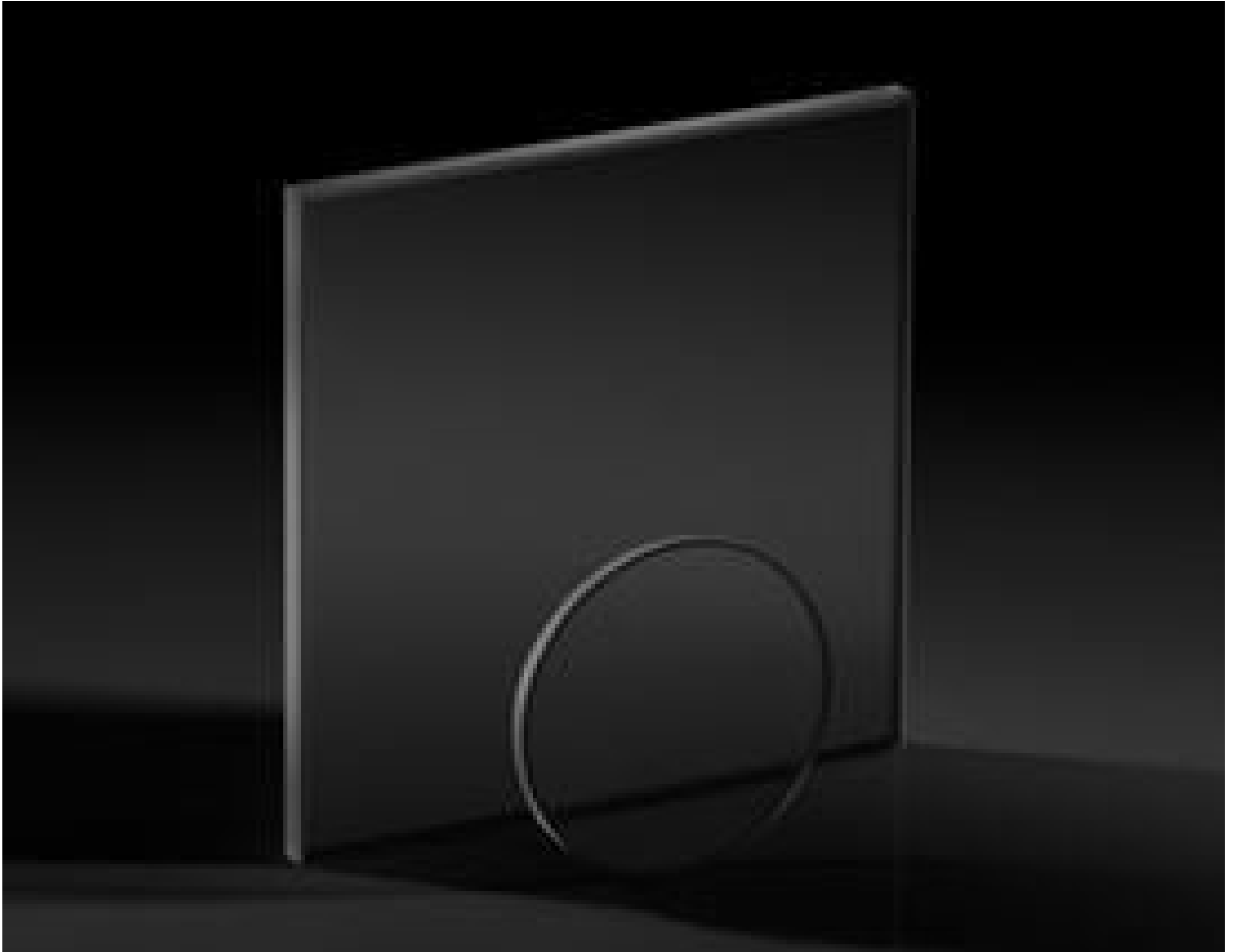
Precision Absorptive Neutral Density (ND) Filters