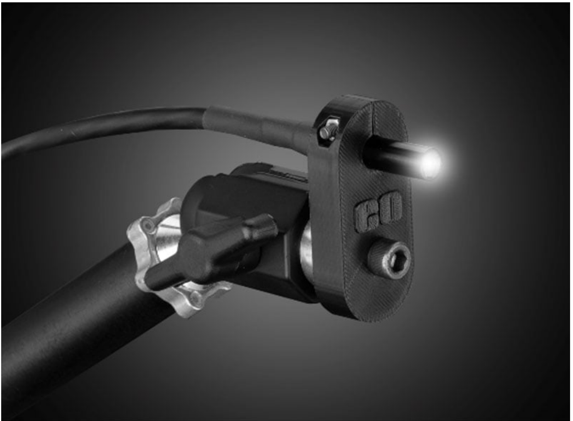
Spot Light Configuration