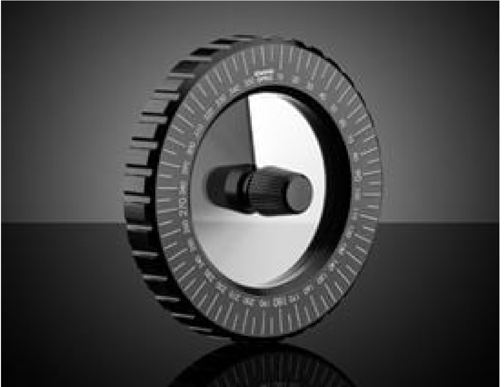
Mounted Circular Variable Neutral Density (ND) Filters