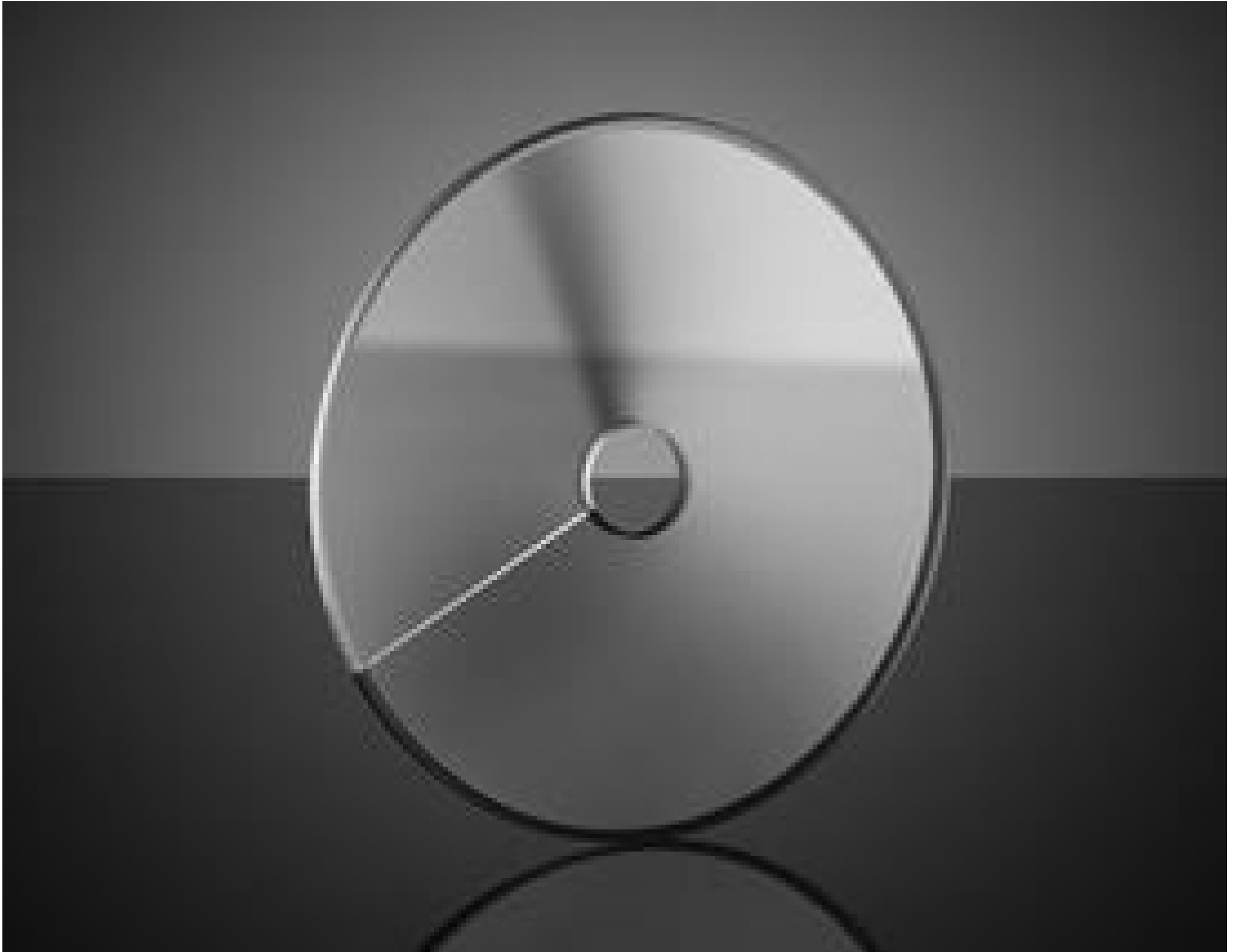
Unmounted Circular Variable Neutral Density (ND) Filters