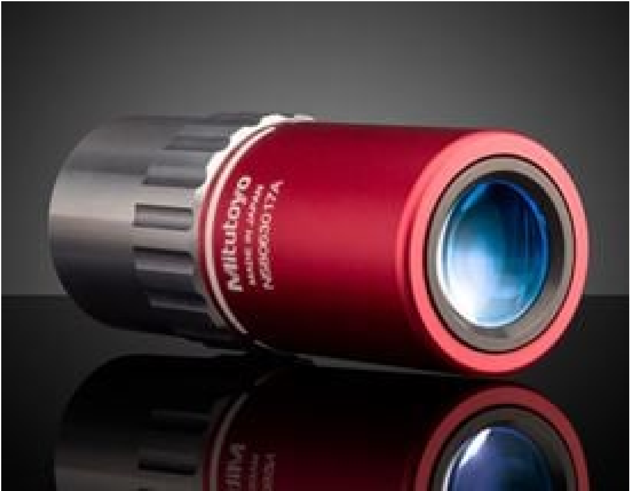
100X Mitutoyo Plan Apo NIR Infinity Corrected Objective, #46-406