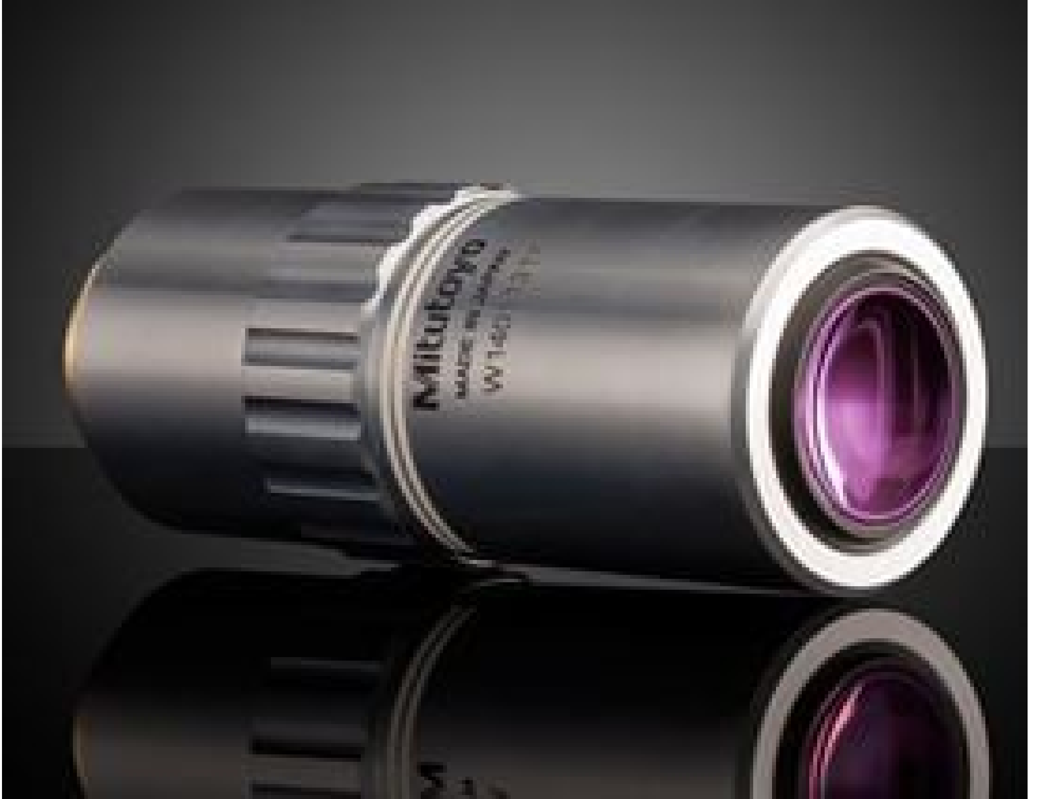
100X Mitutoyo Plan Apo SL Infinity Corrected Objective, #46-401