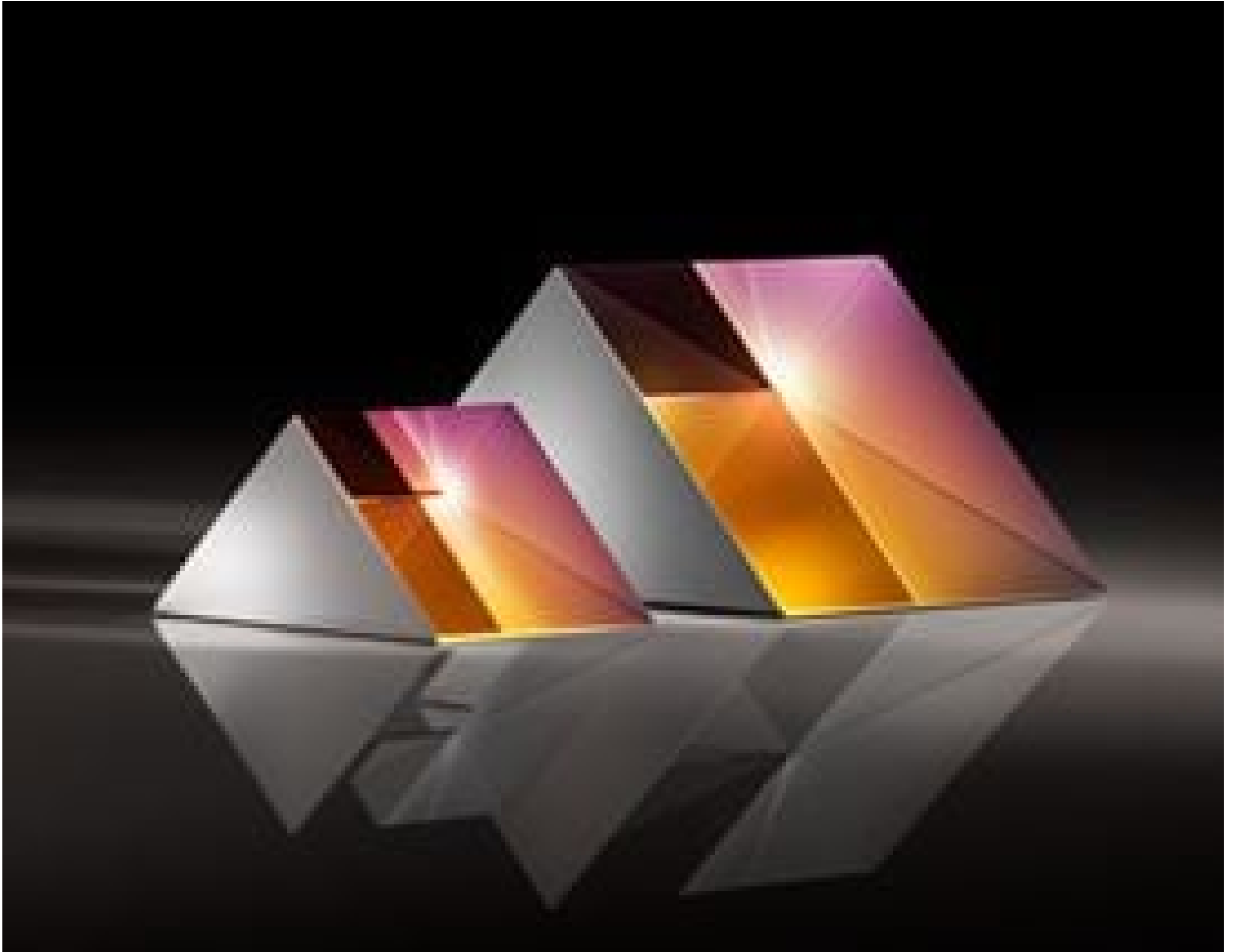
TECHSPEC UV Fused Silica Right Angle Prisms