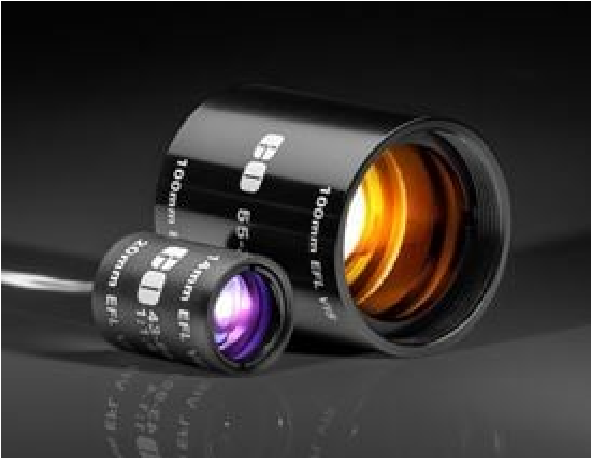
TECHSPEC Mounted Achromatic Lens Pairs