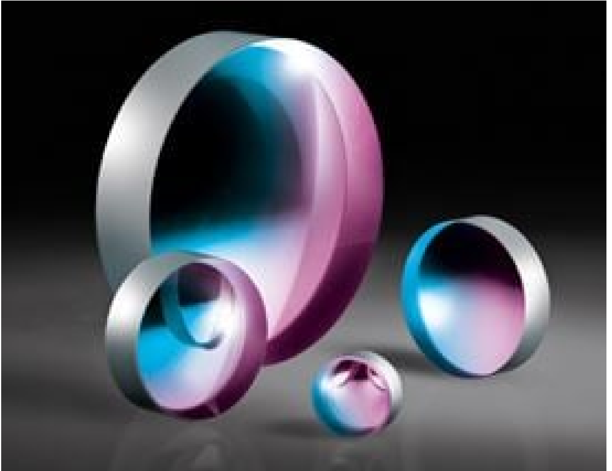
UV Fused Silica Plano-Concave (PCV) Lenses