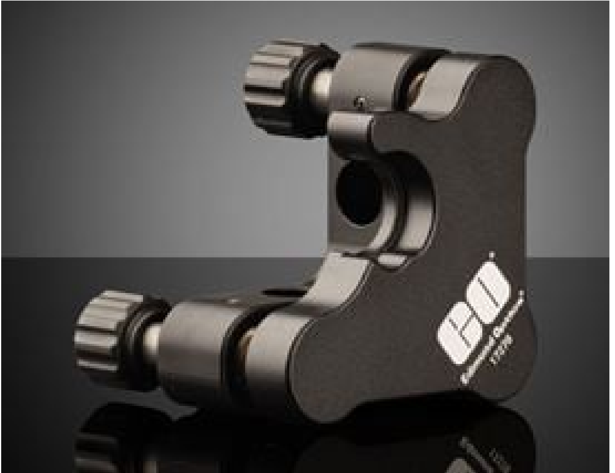
#17-278, 12.5/12.7mm Optic Dia., E-Series Clear Edge Kinematic Mount