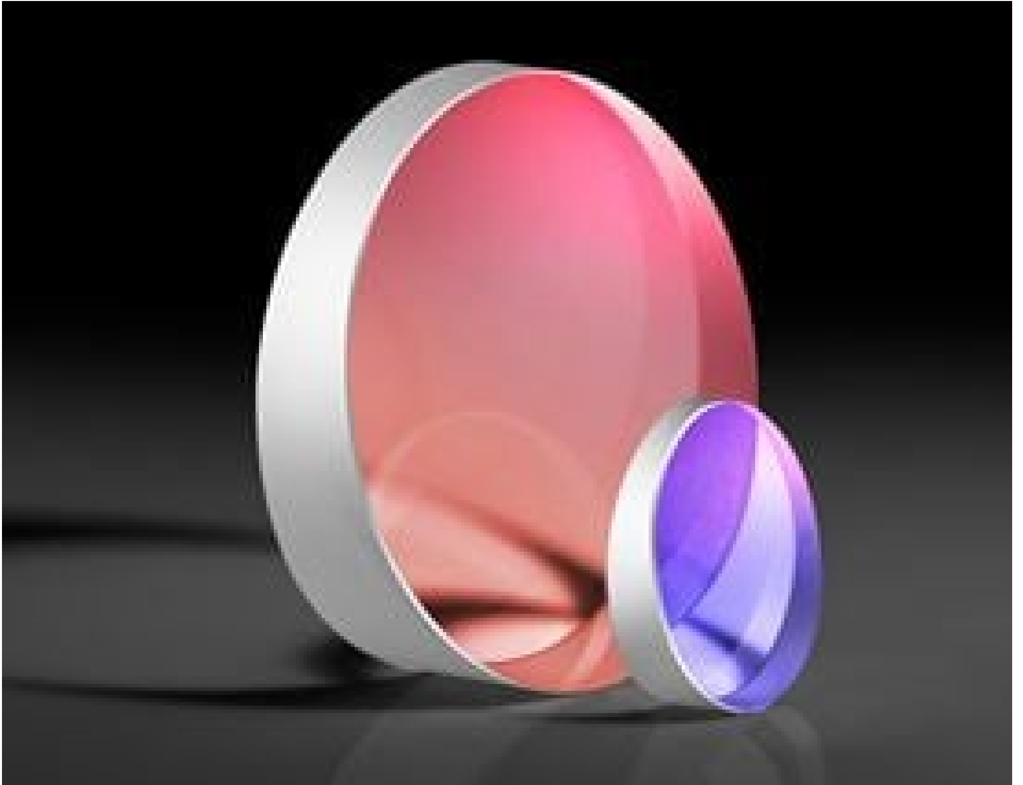
TECHSPEC Fused Silica Wedge Prisms