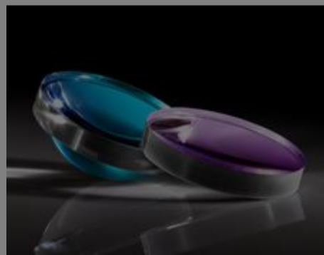
#48-170 - 25.4mm Dia f/1 Uncoated, Molded Acrylic Aspheric Lens €67,00