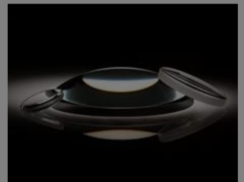
#45-961 - 3.0mm Dia. x 4.5mm FL, NIR I Coated, Plano-Convex Lens €73,50