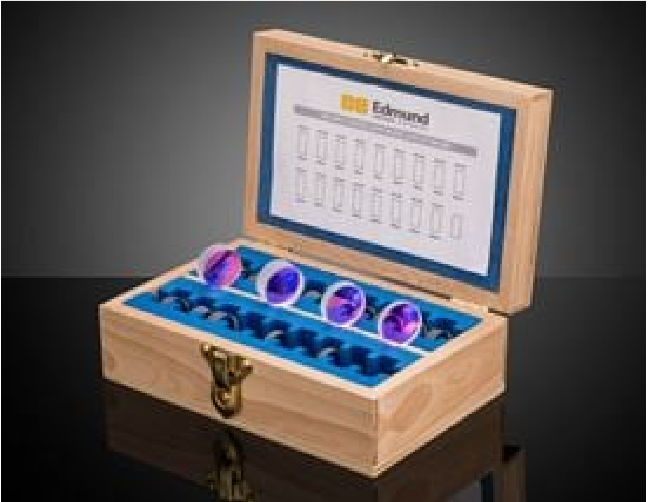
Achromatic Lens Kit