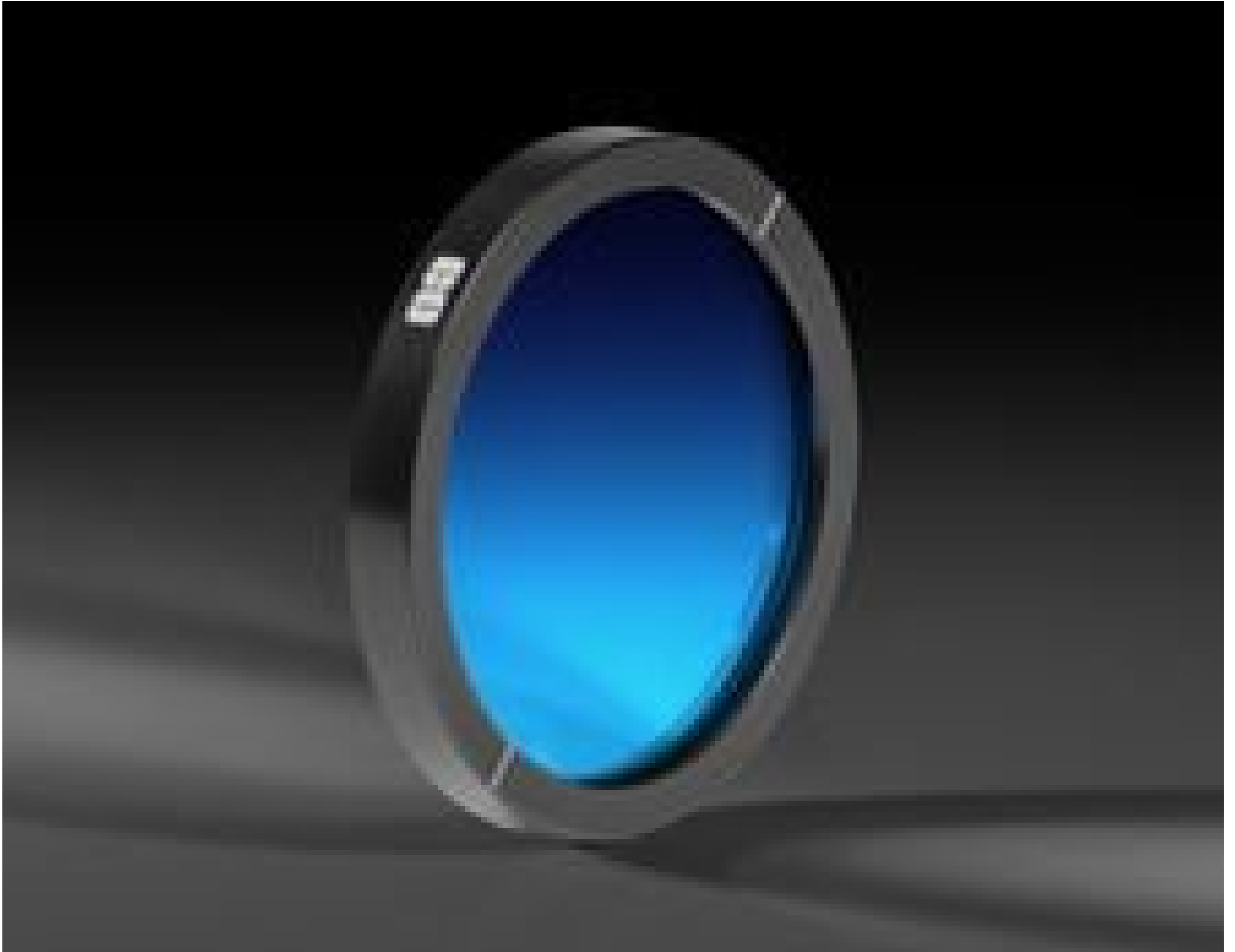
Mounted Ultra Broadband Wire Grid Linear Polarizer