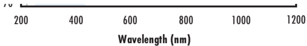
Fused Silica with UV-VIS Coating Typical Transmission