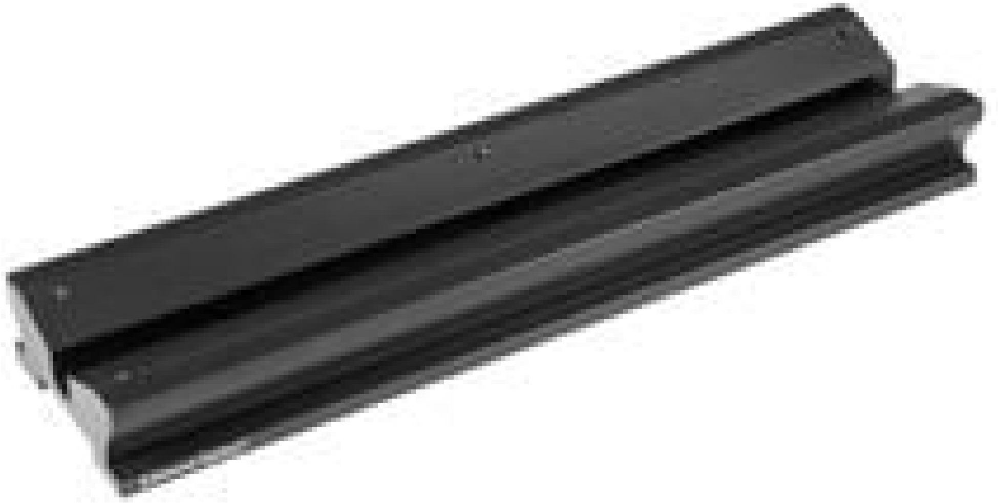
12" Length, Dovetail Optical Rail, #54-401