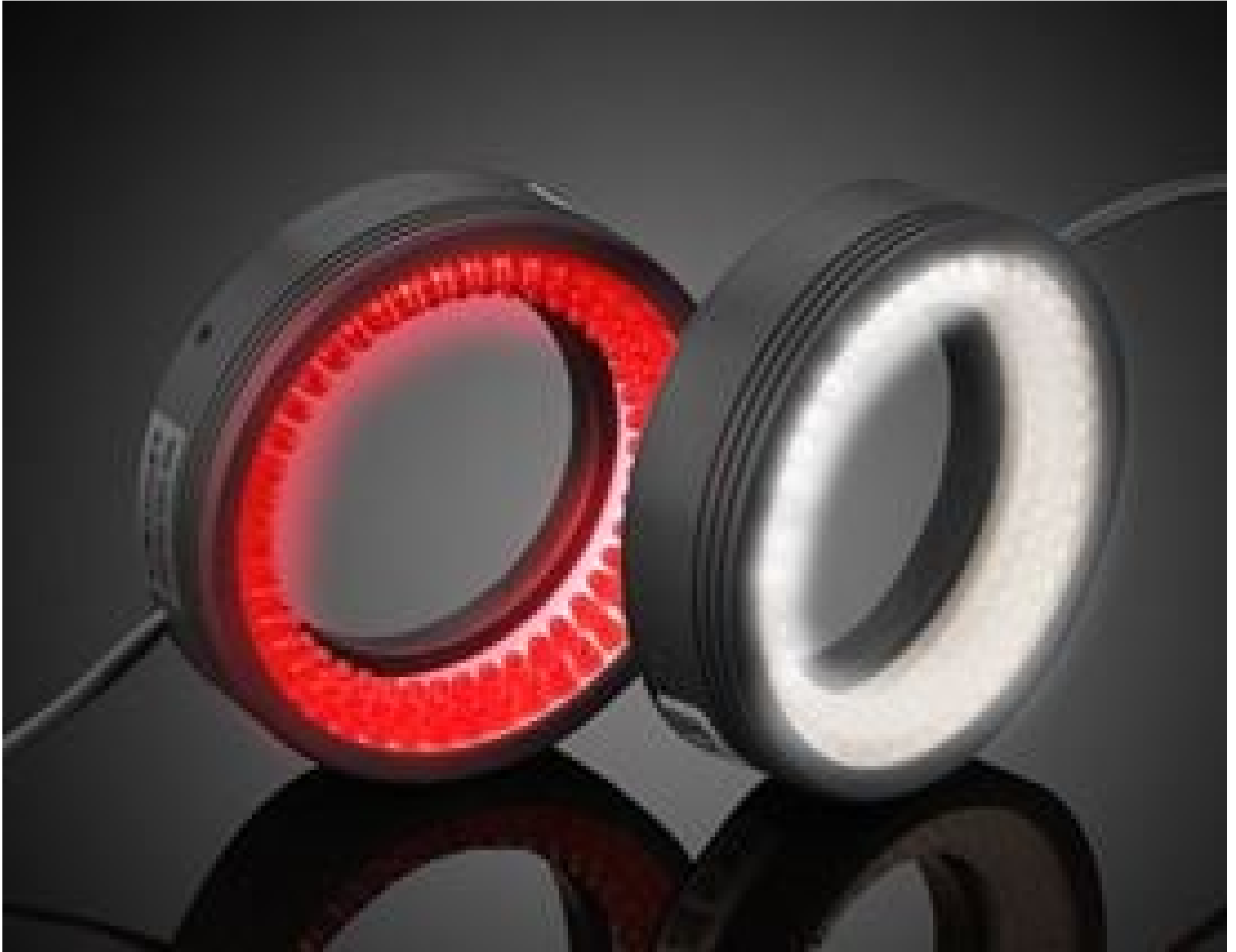
CCS Low-Angle LED Ring Lights