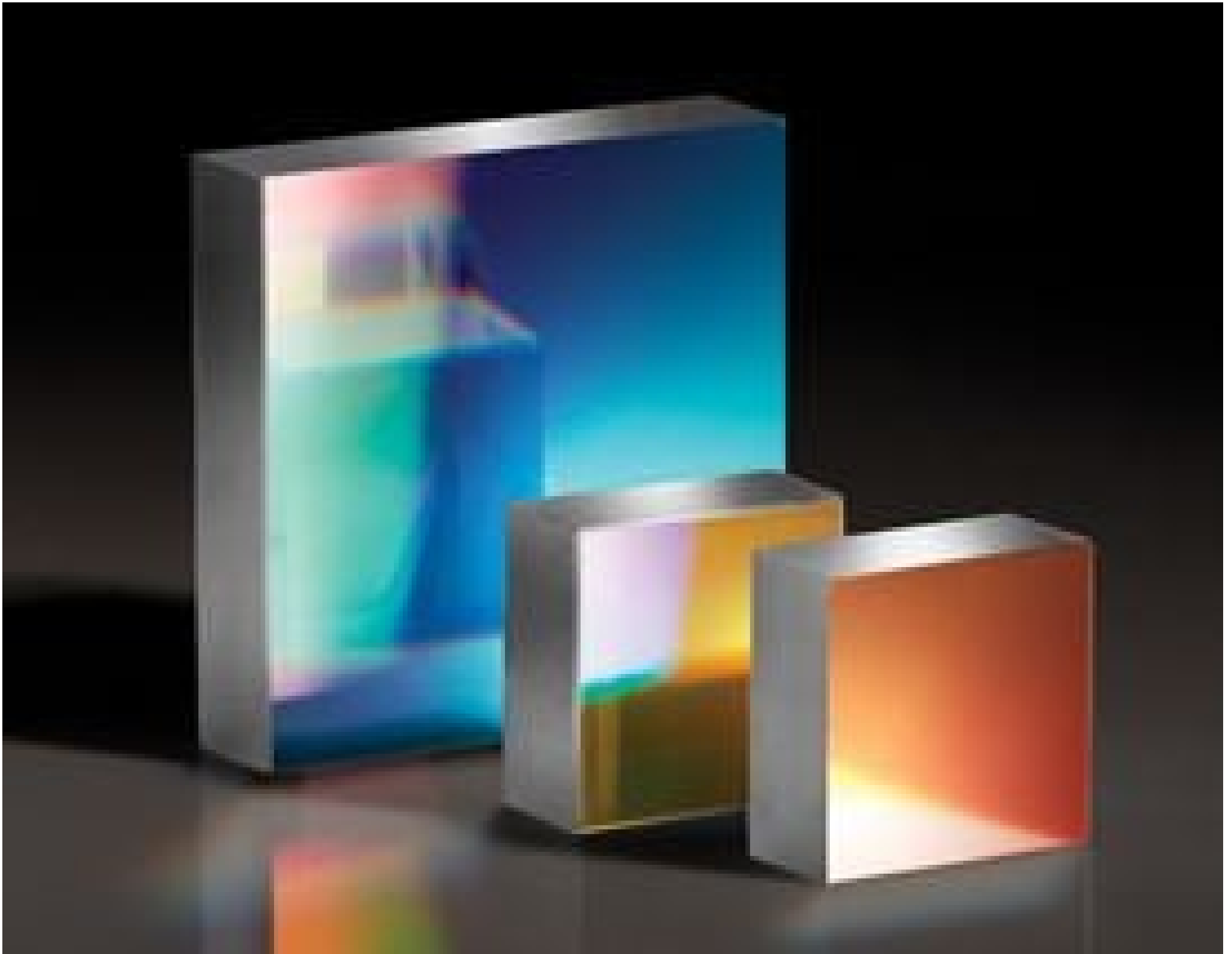
Richardson Gratings™ High Precision Plane Ruled Reflective Diffraction Gratings