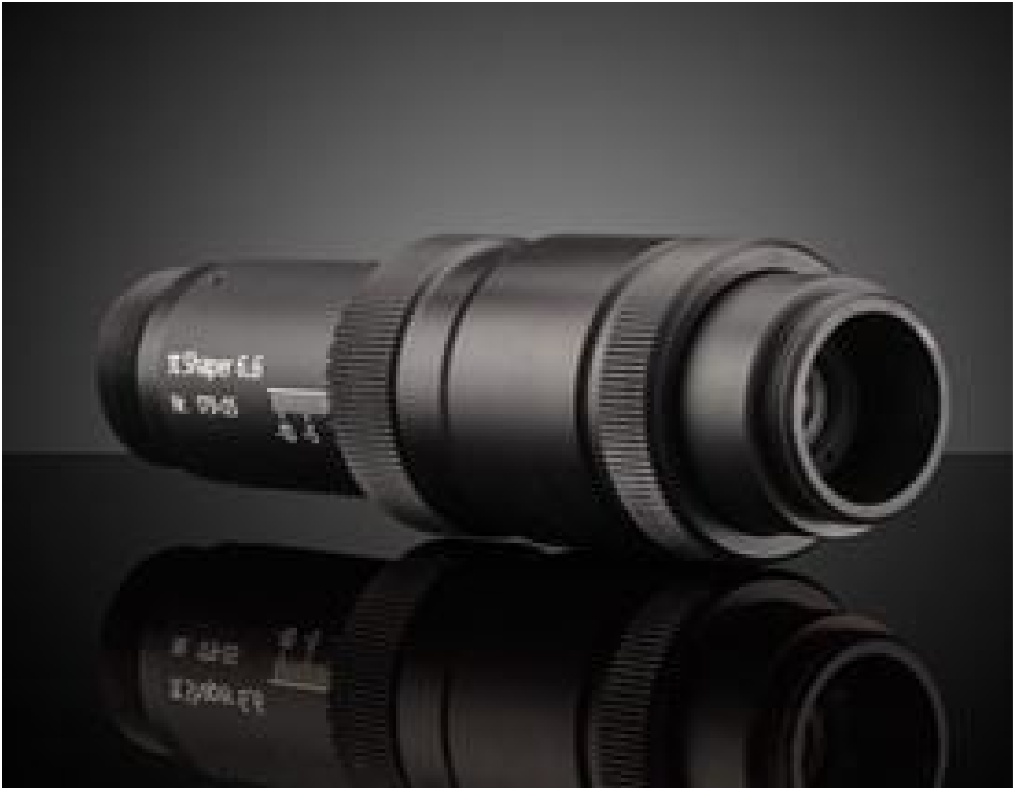
Flat Top Beam Shaper