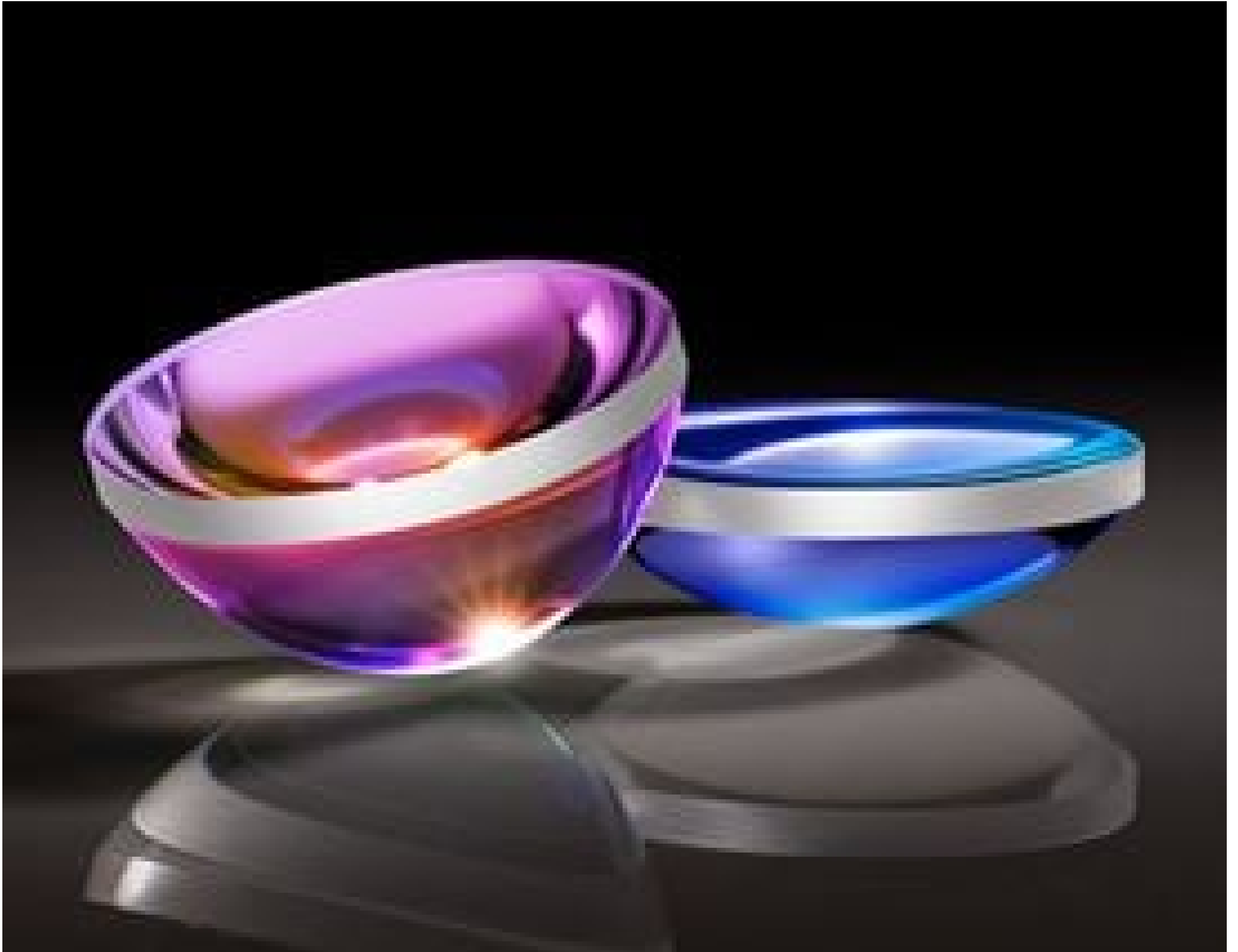
TECHSPEC UV Fused Silica Aspheric Lenses