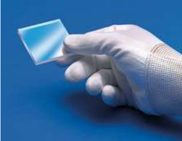
Component Handling Tools

These optics require special handling to avoid damage and ensure long-term performance. Proper handling, cleaning, and storage are essential to maintain optical quality. Explore our Optics Cleaning Resources for step-by-step guides and best practices. For personalized assistance, Email us or Chat with our technical support team.