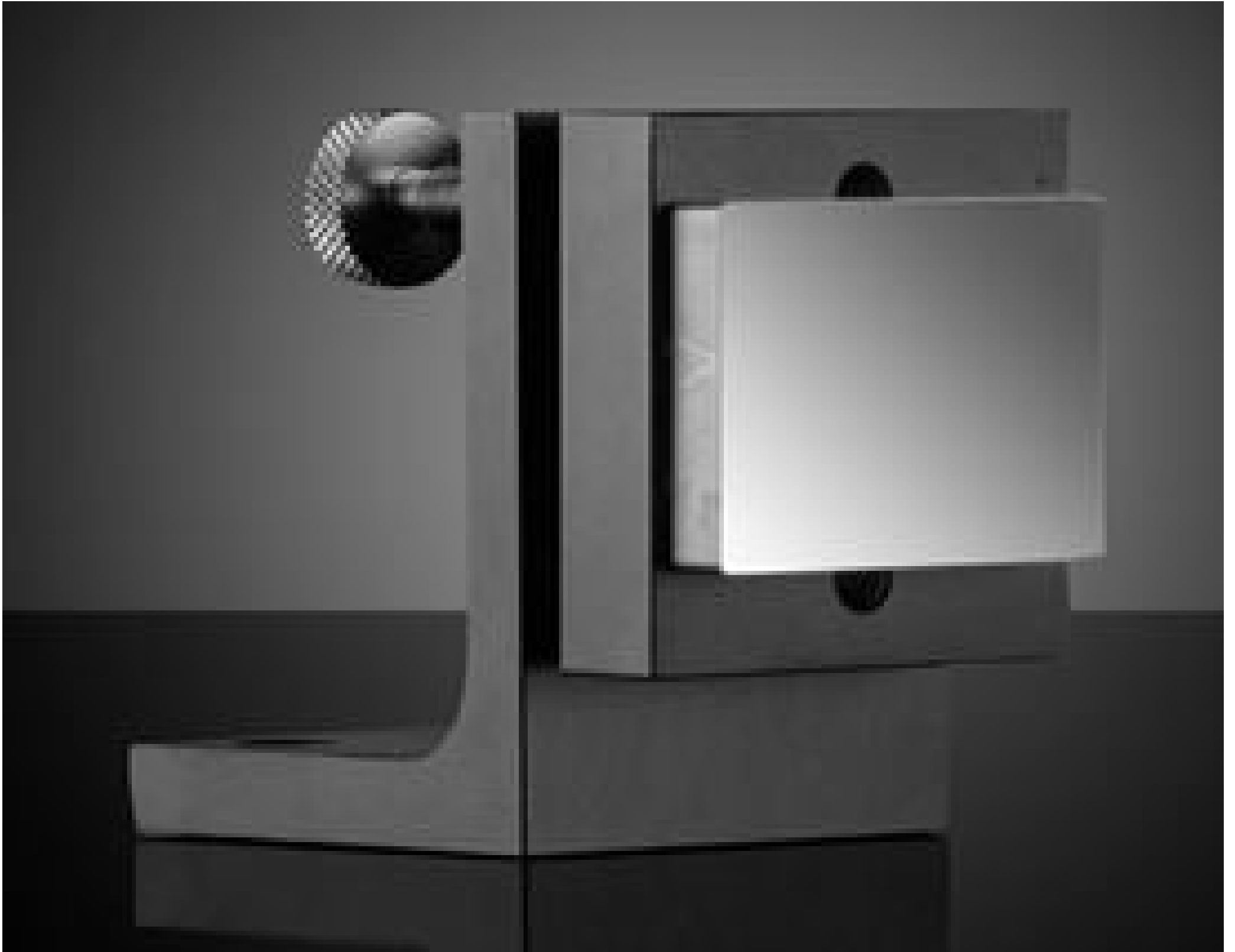
1.5" Reverse Angle Mirror Mount with Mirror