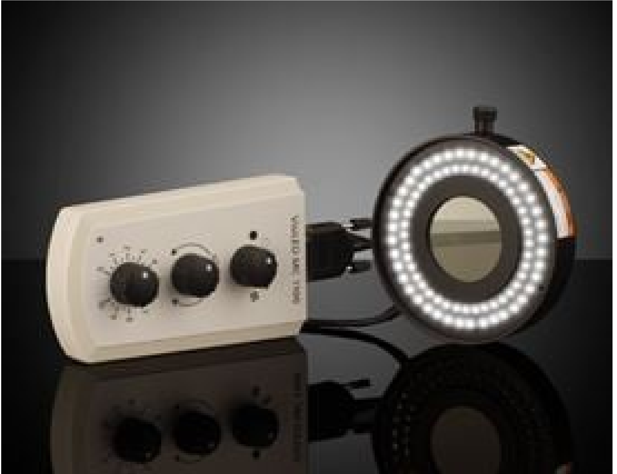
Ring light, controller & power supply required and sold separately.