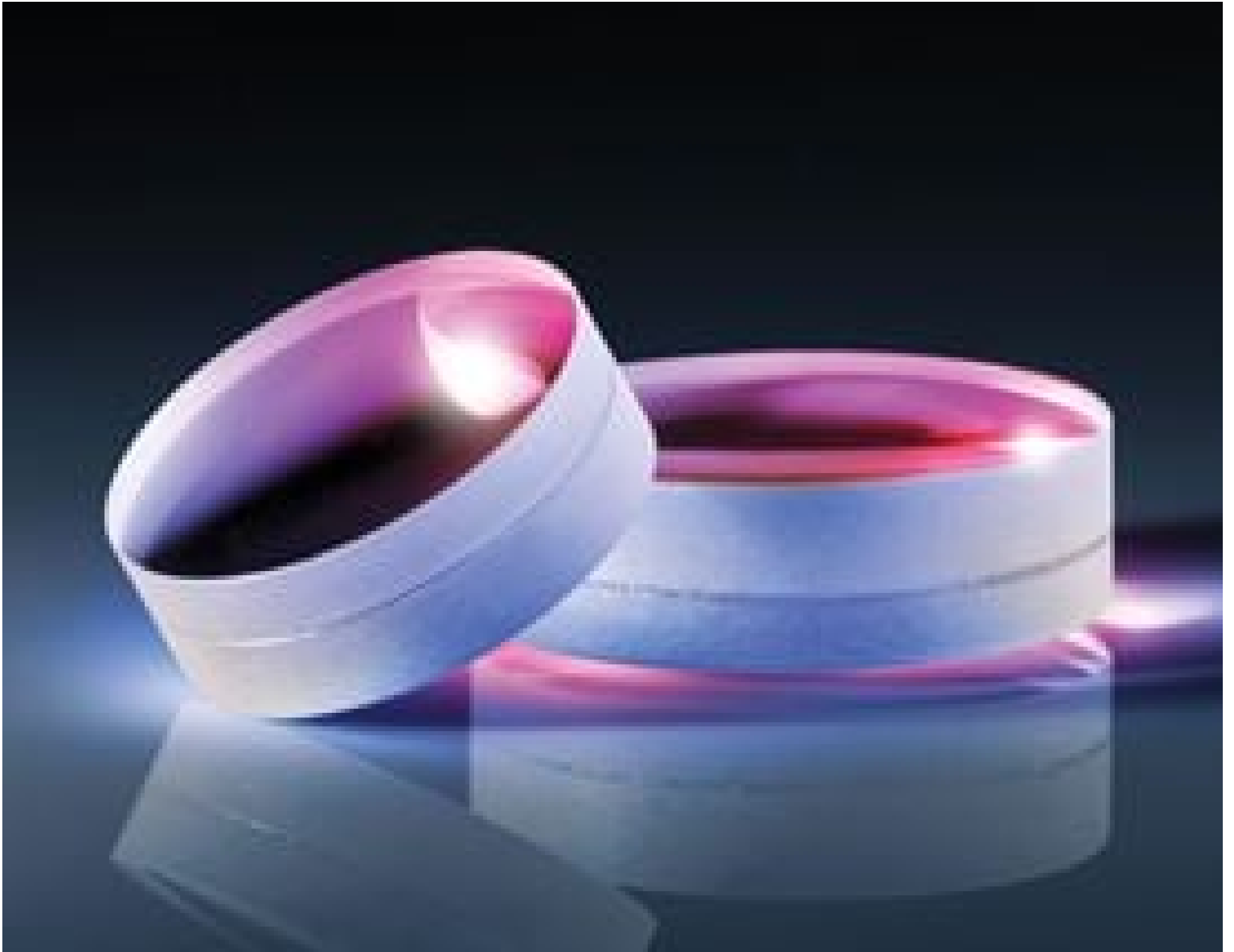
MgF 2 Coated Achromatic Lenses