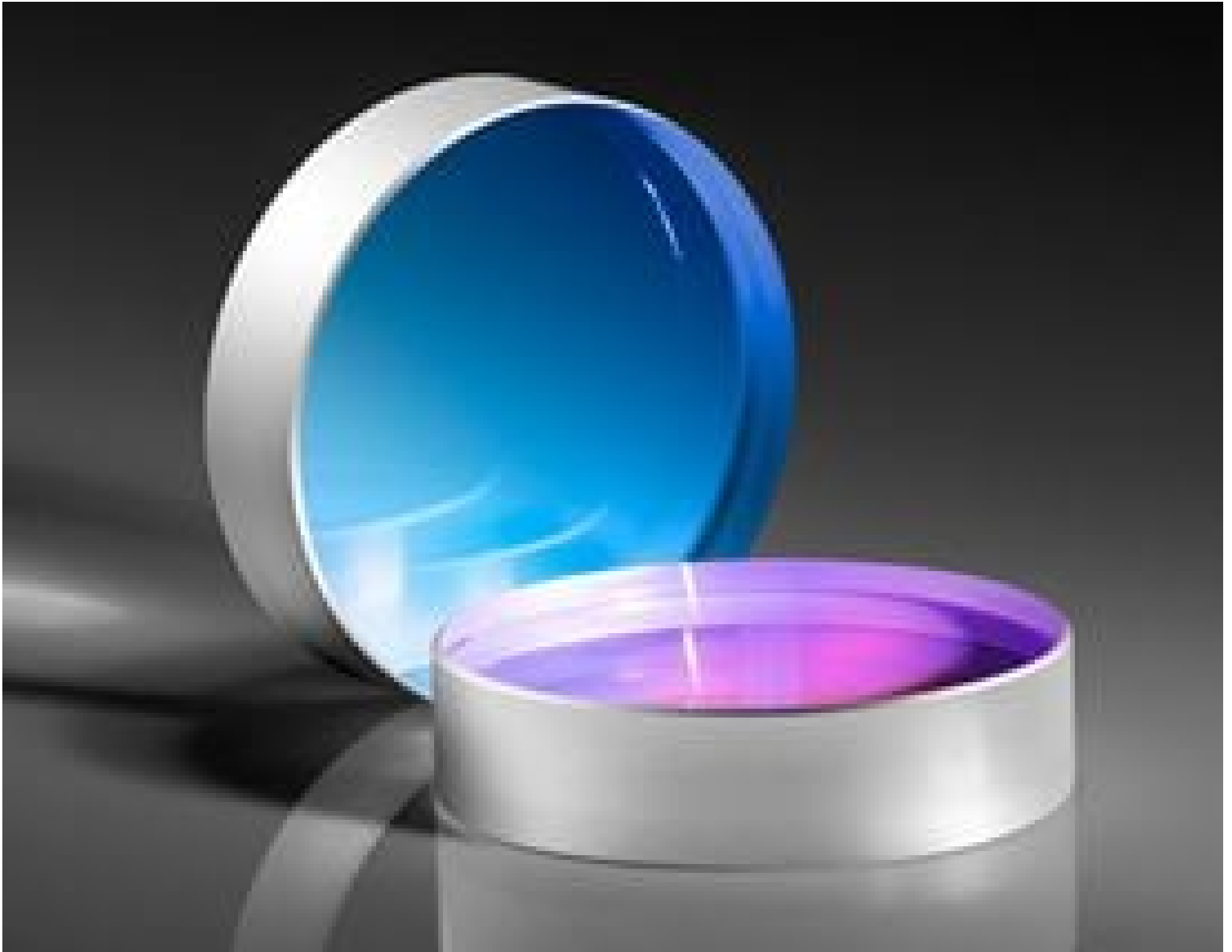
TECHSPEC® Nd:YAG Laser Line Beam Samplers