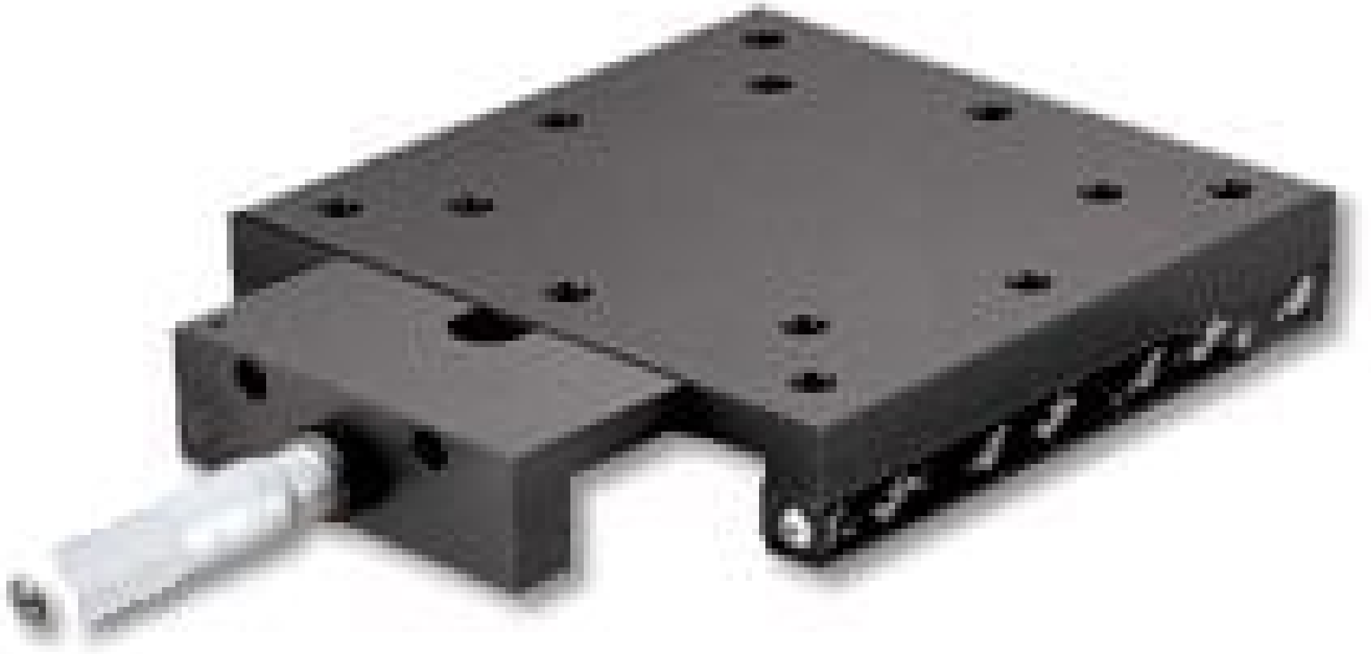
Solid Top Stage