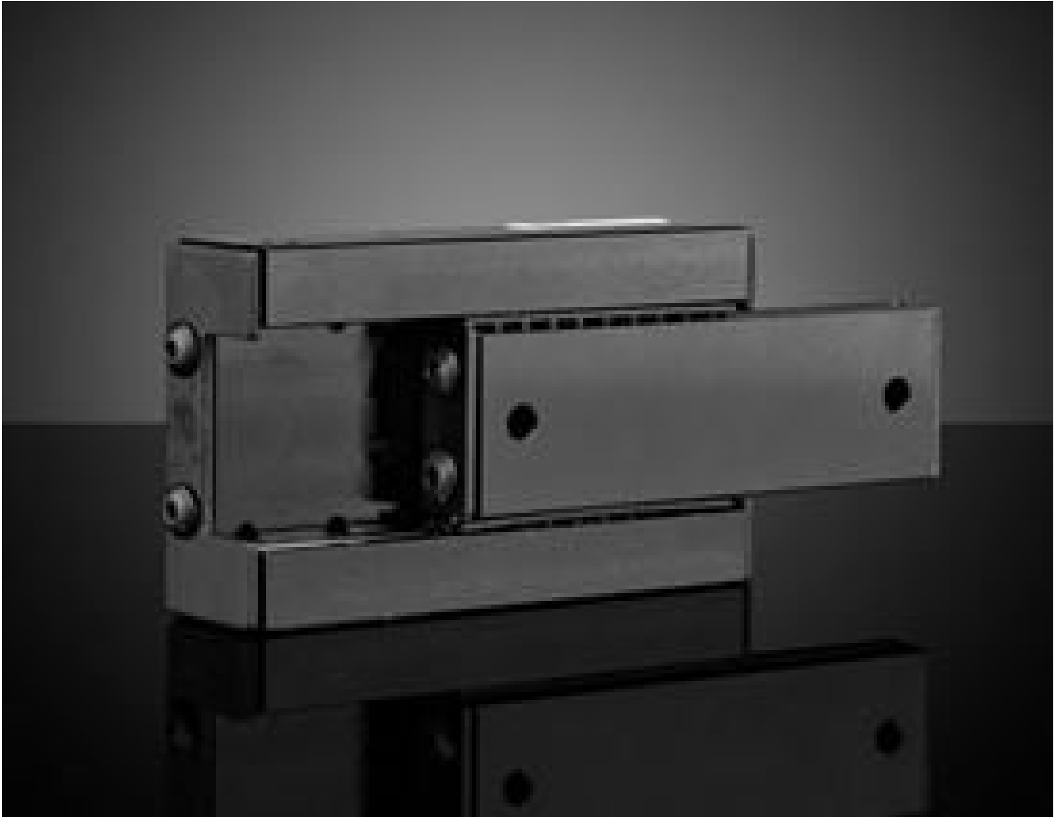
2" Travel, 3"L x 1.75"W Ball Bearing Slide, #37-361