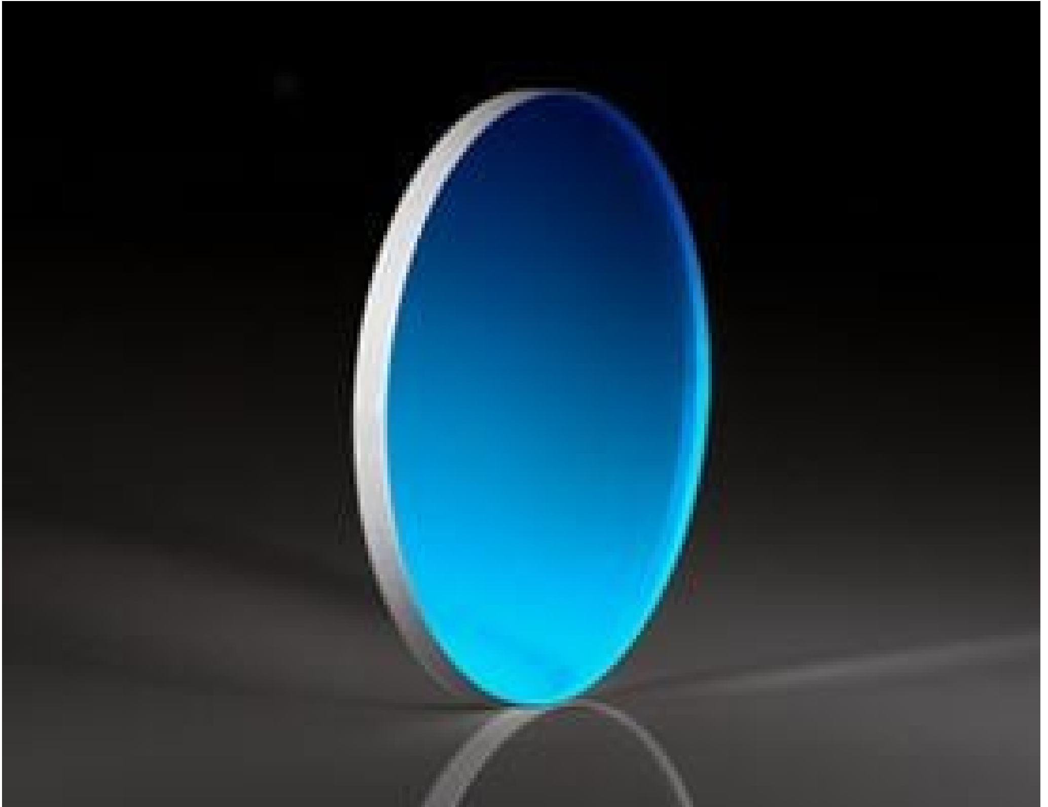
Uncoated \lambda/20 Fused Silica Window