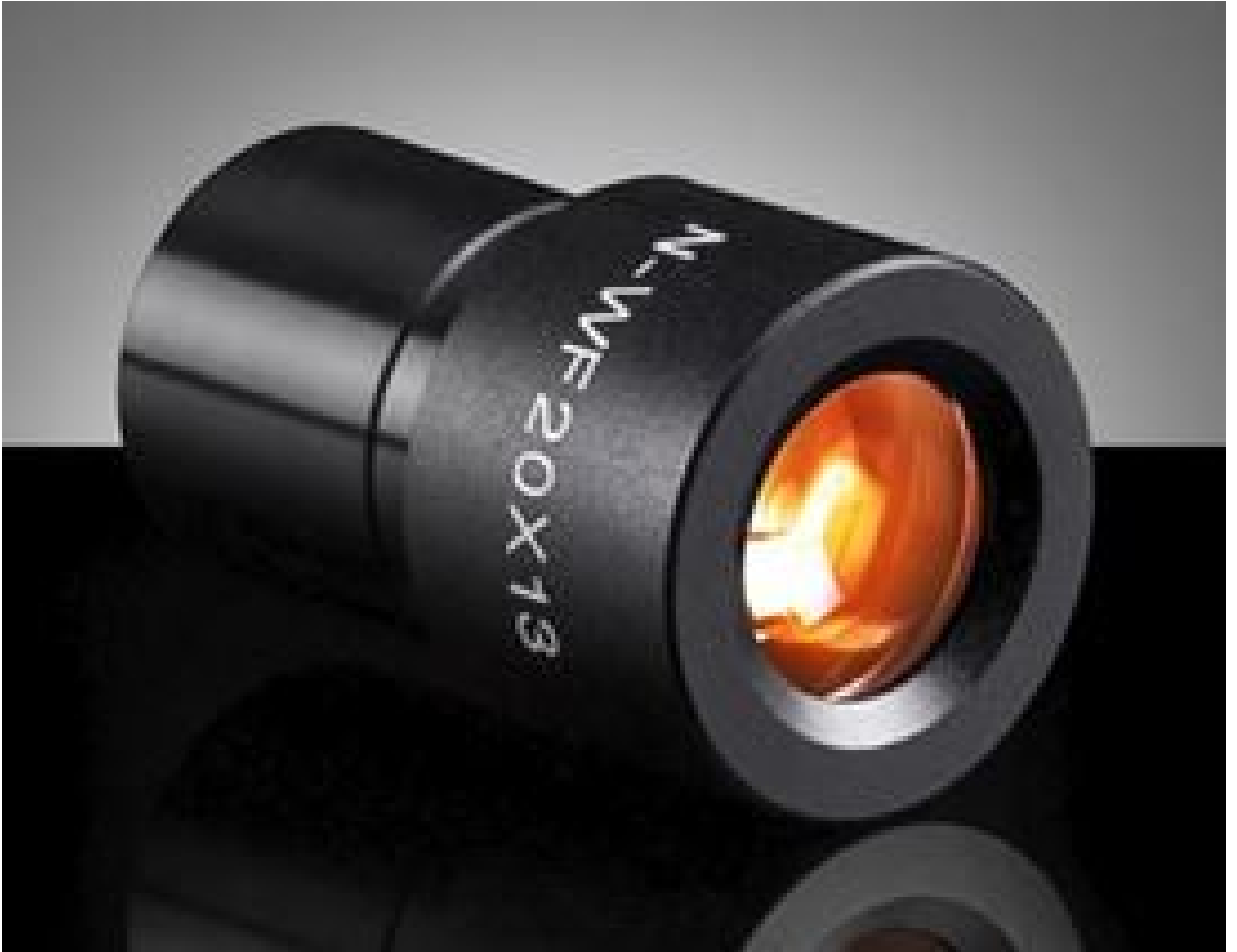
20XDIN Eyepiece, #35-692