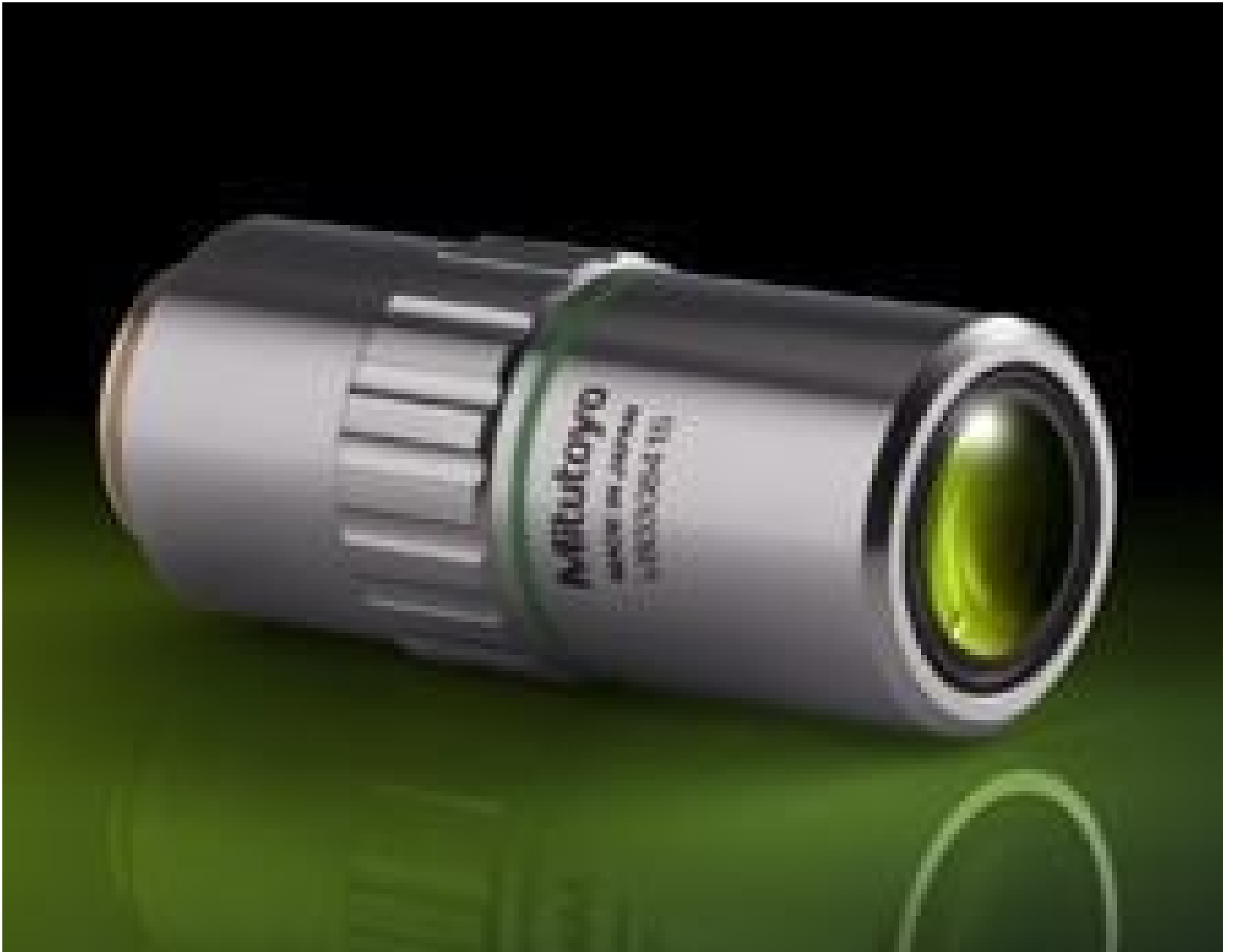
20X Mitutoyo Plan Apo Infinity Corrected Long WD Objective, #46-145