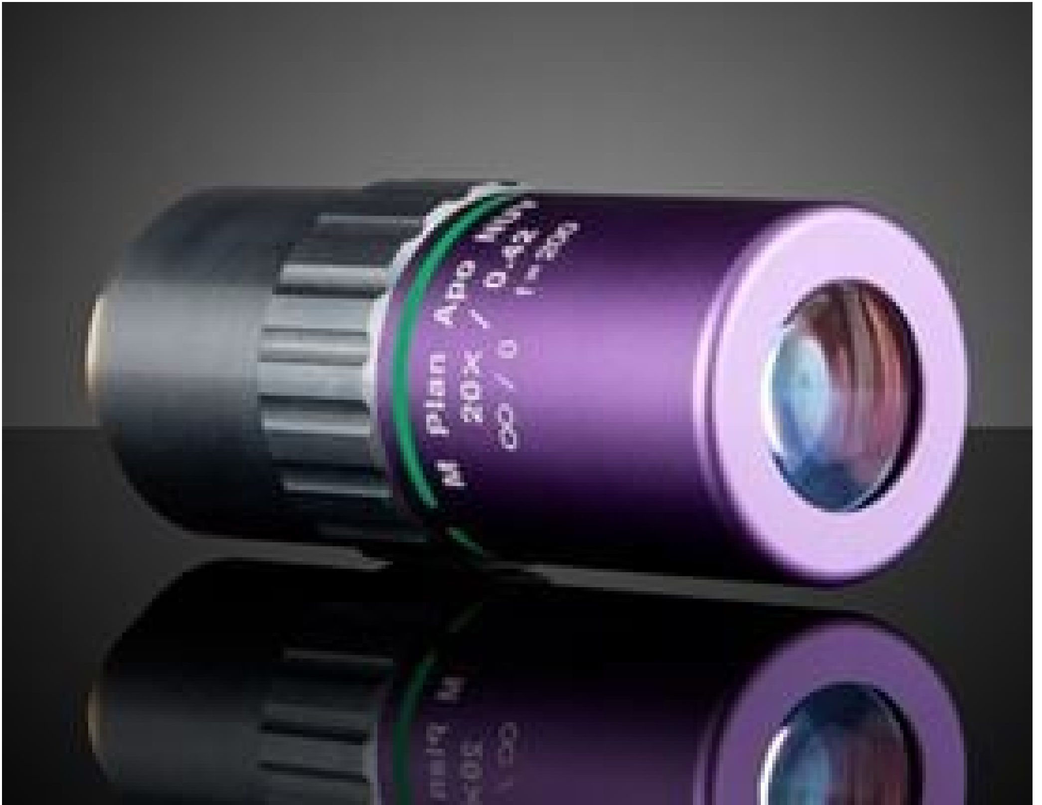
20X Mitutoyo Plan Apo NUV Infinity Corrected Objective, #46-407