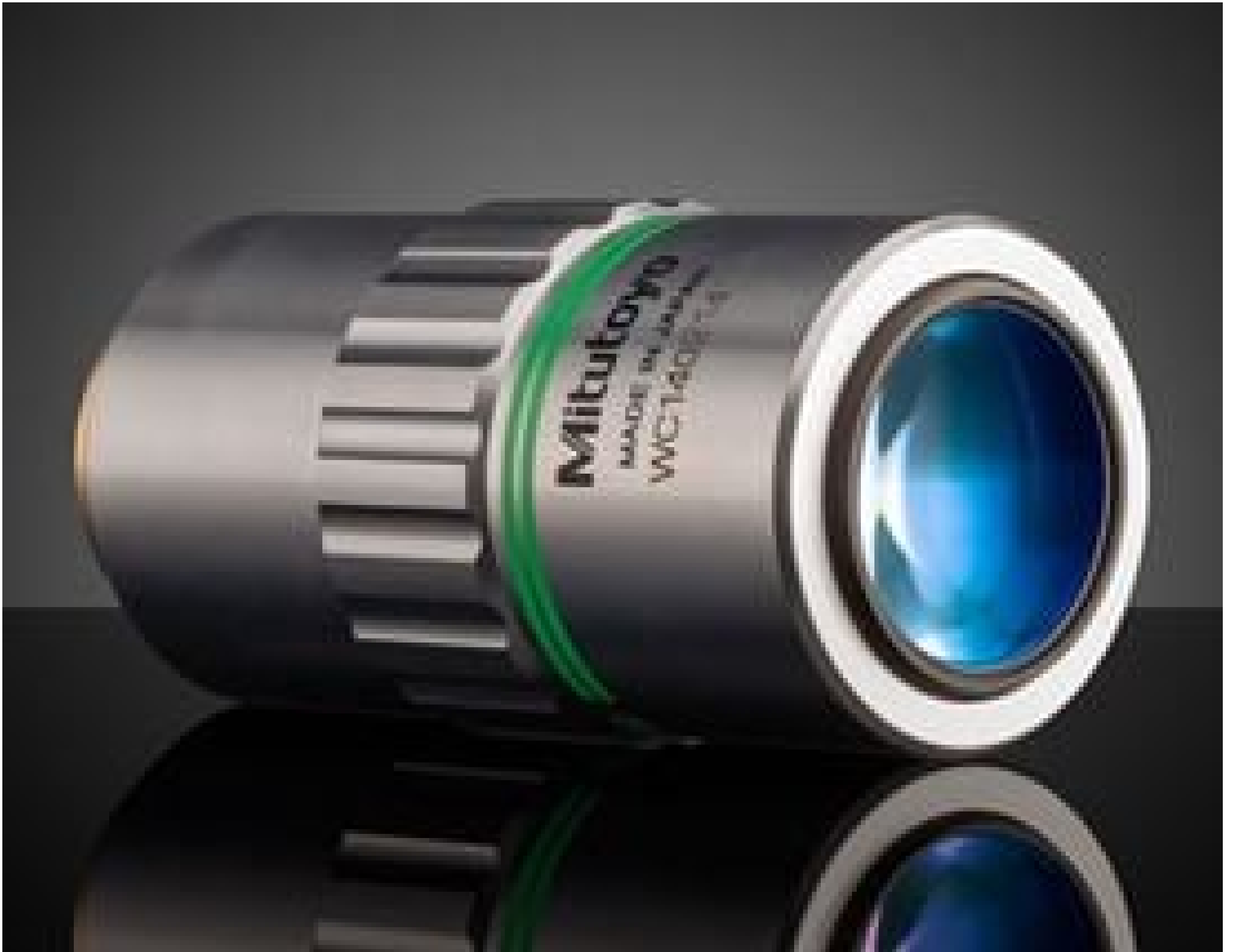
20X Mitutoyo Plan Apo SL Infinity Corrected Objective, #46-398