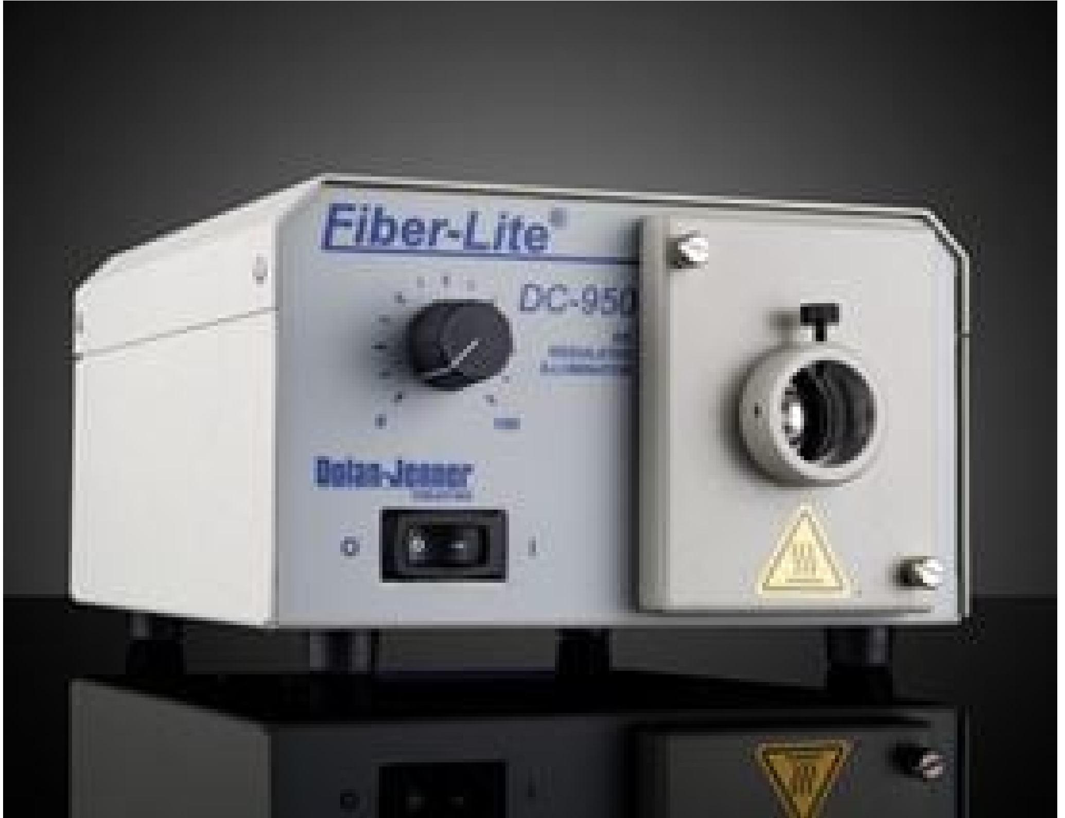
230V, with UK Cord, DC950HK Illuminator, #62-006