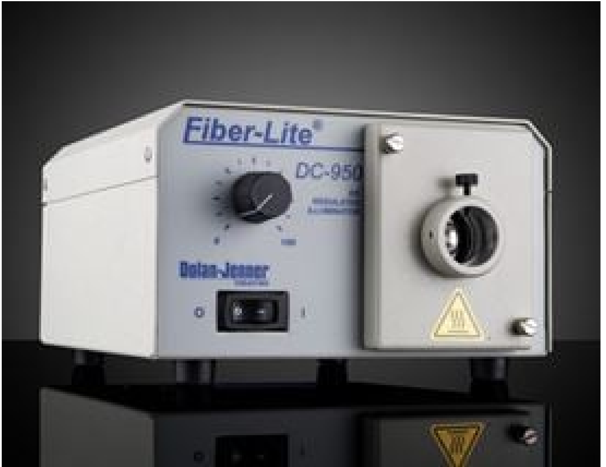
230V, with UK Cord, DC950HK Illuminator, #62-006