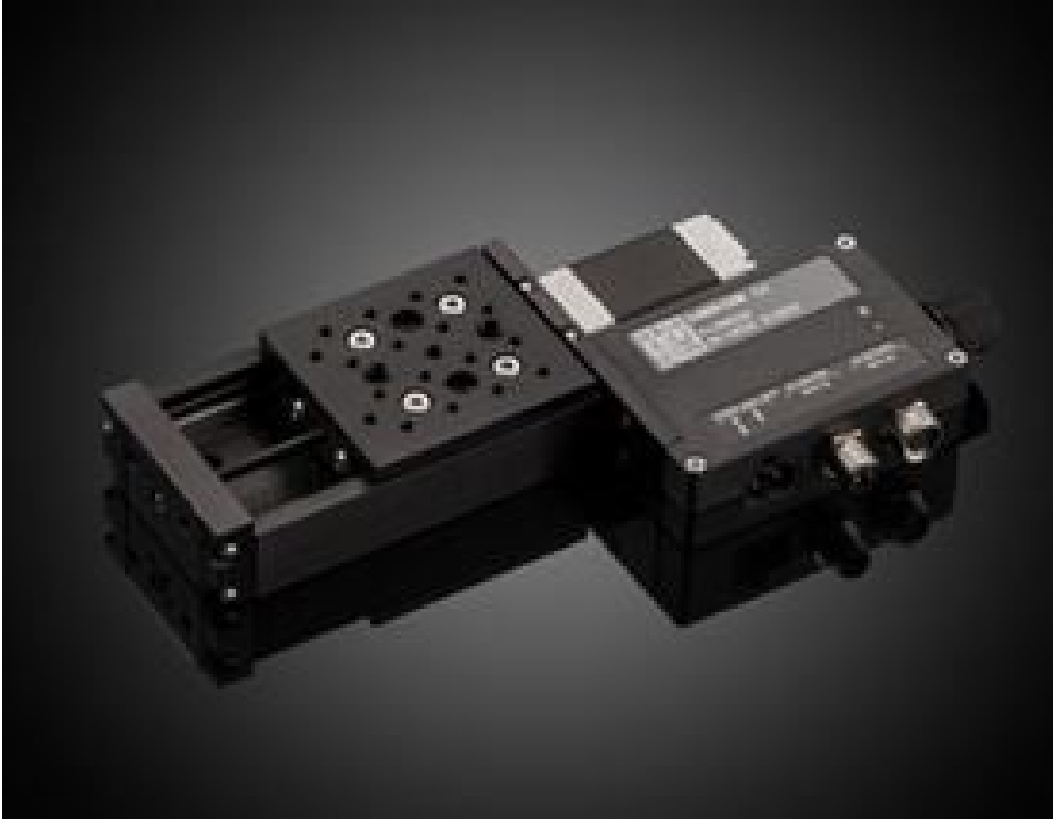
#15-285, 25 mm Travel, Motorized Linear Stage, Integrated Controller