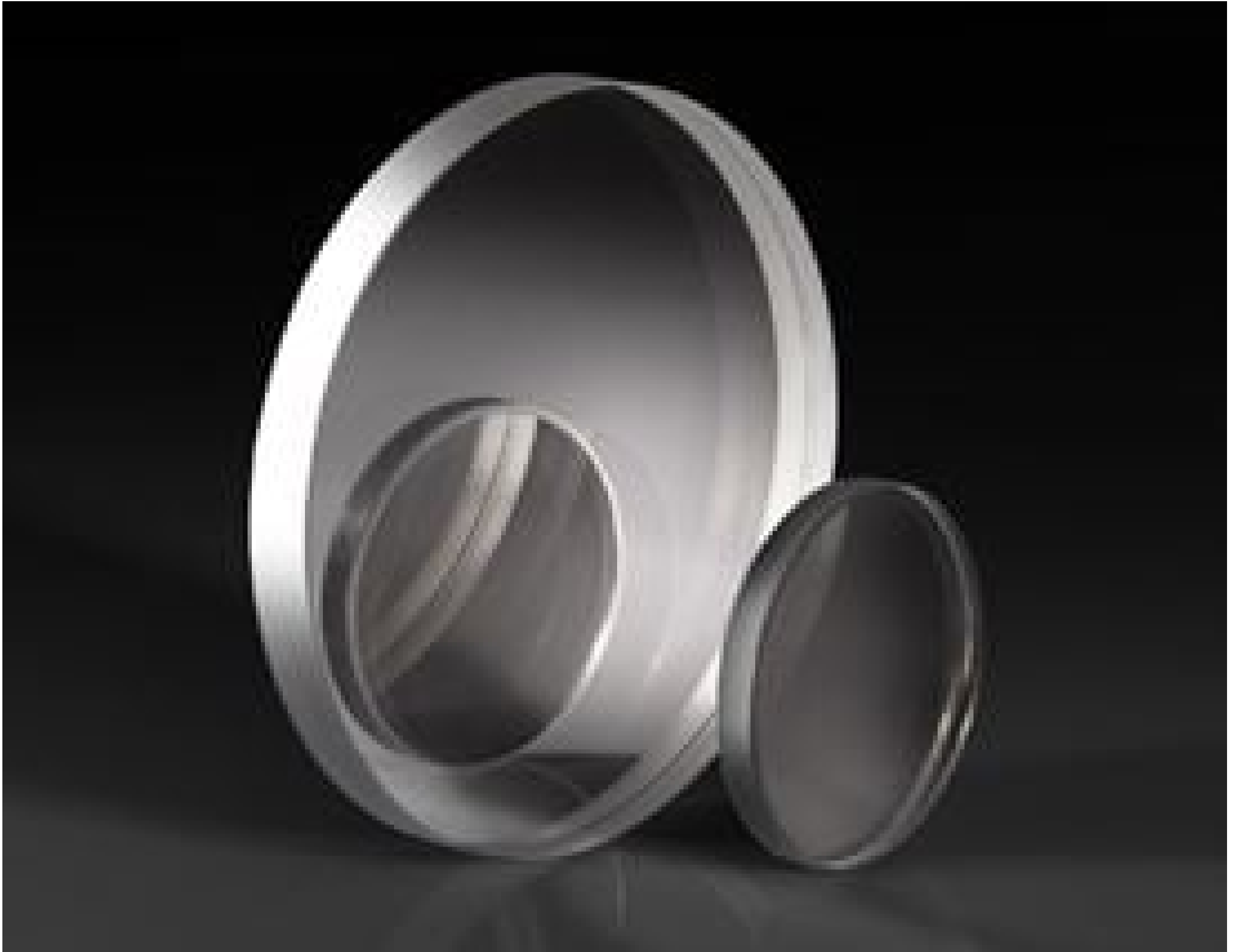
UV-NIR Neutral Density Filters