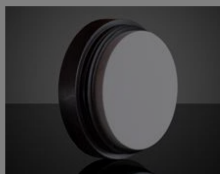
#54-302 - Spectralon® White Diffuse Reflectance Standard (99%) €595,00