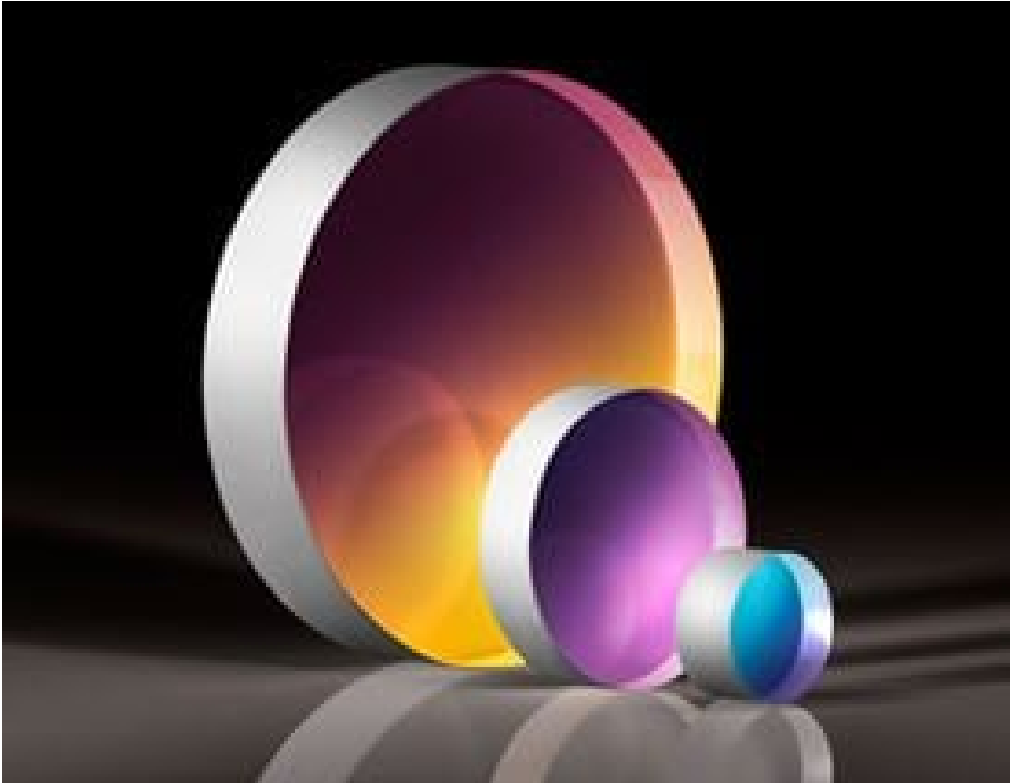
TECHSPEC Excimer Laser Line Mirrors