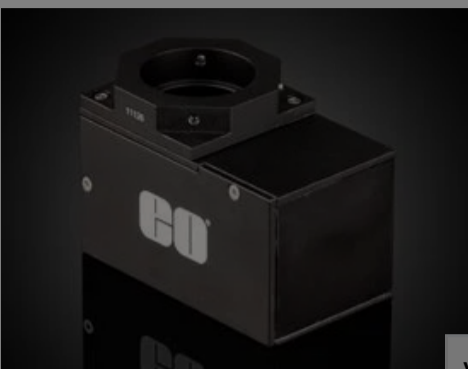
Optical Axis Offset Prism Adapter