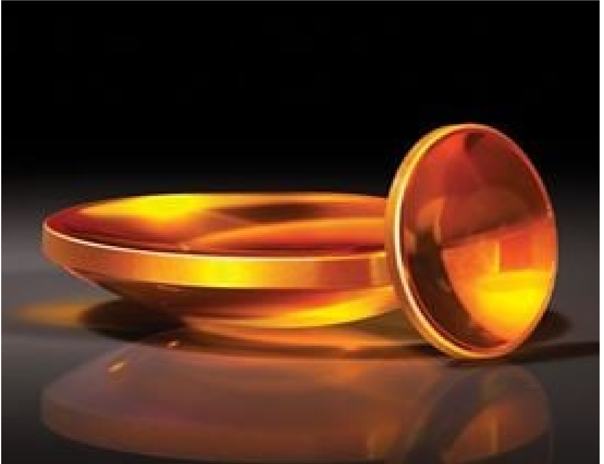
TECHSPEC Zinc Selenide (ZnSe) Aspheric Lenses