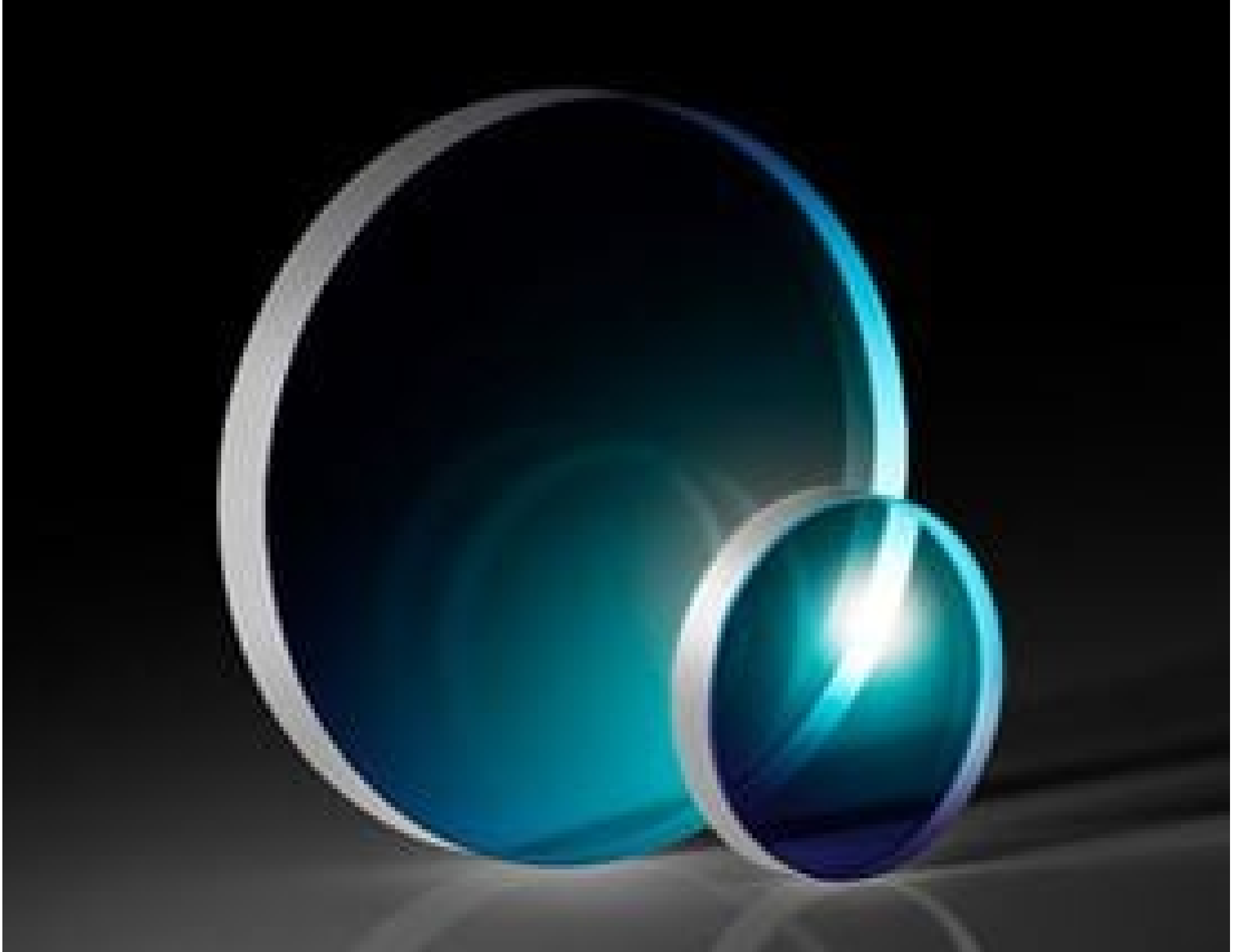
Barium Fluoride (BaF 2 ) Wedged Windows