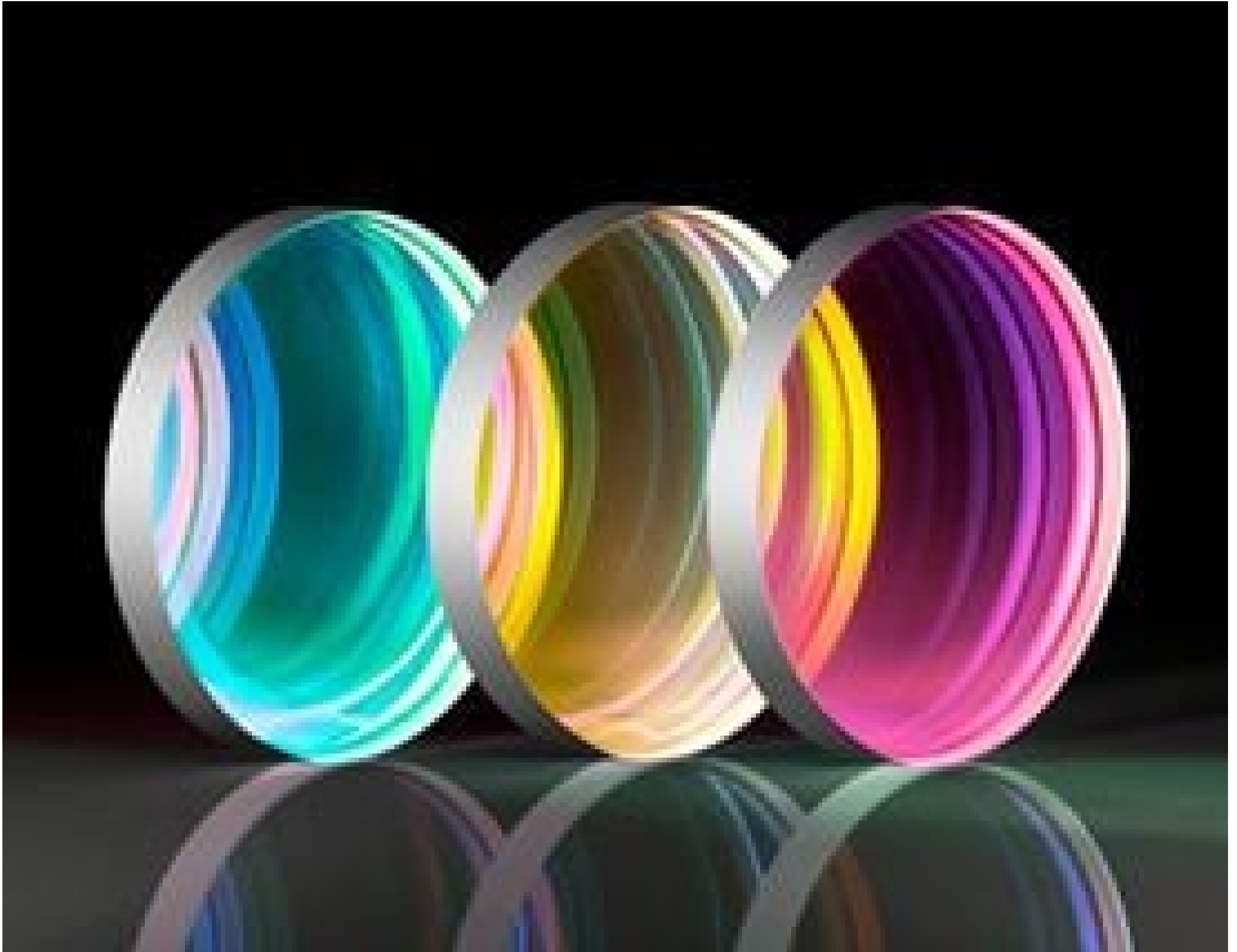
TECHSPEC® Ultrafast Beamsplitters