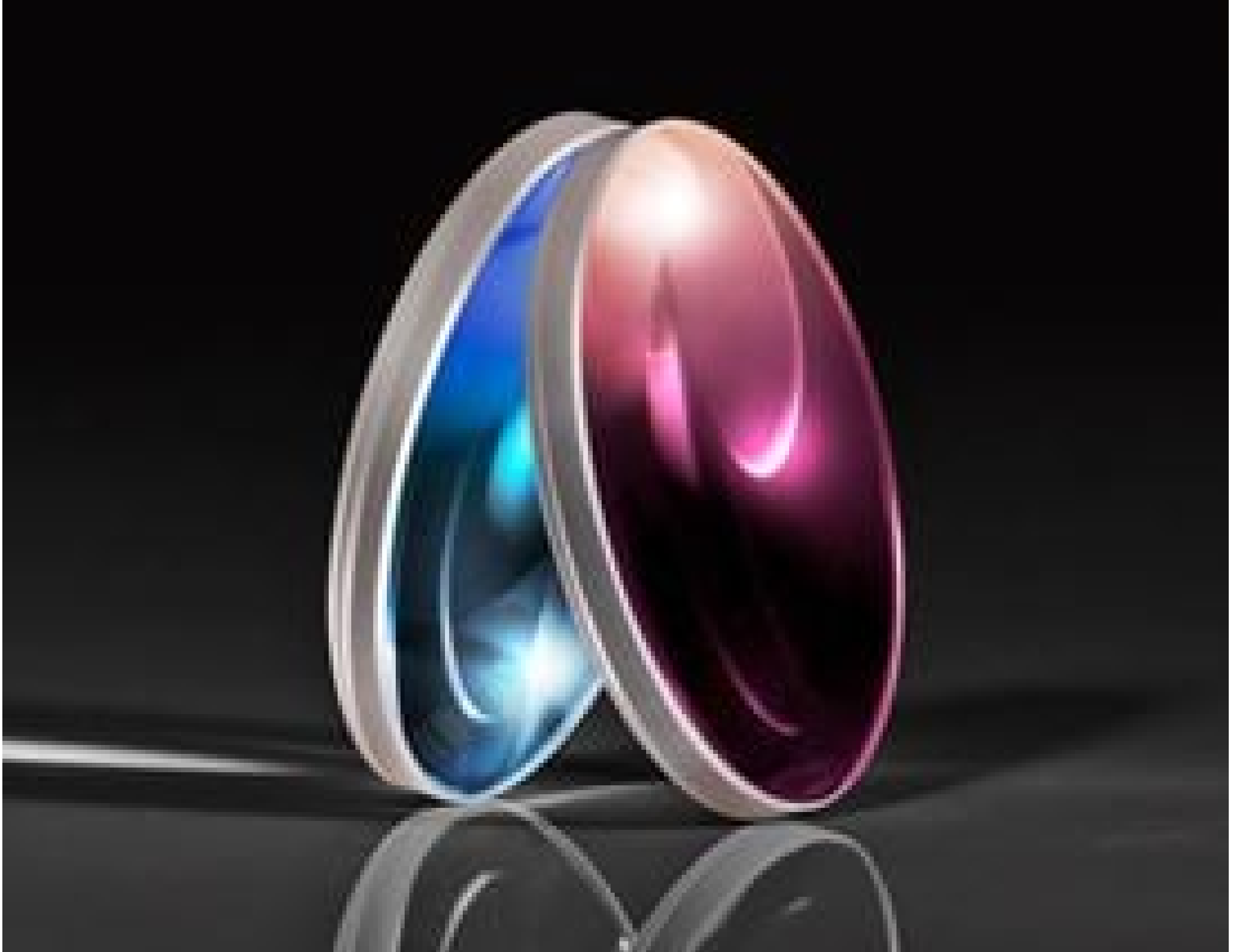
Calcium Fluoride Double-Convex (DCX) Lenses